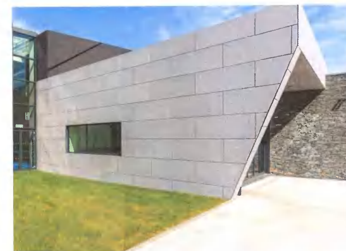
EXAMPLE OF CEMENT FIBRE CLADDING TO SIDE & REAR OF NEW SIDE EXTENSION