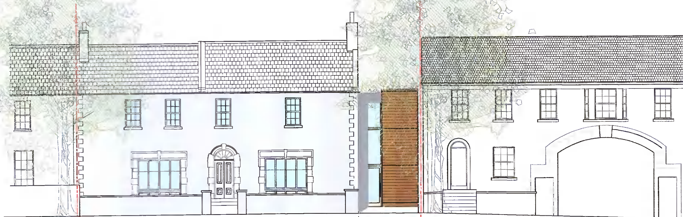
CONTEXTUAL FRONT ELEVATION SCALE 1:100