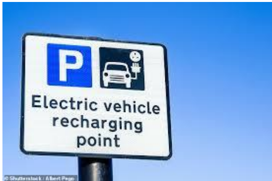
EV CHARGING POINT SIGNAGE