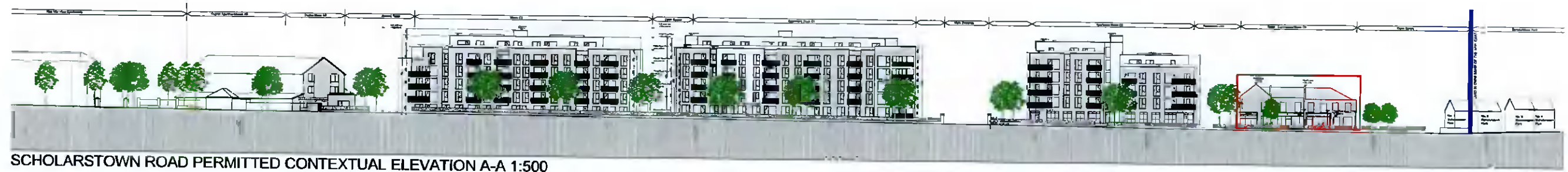
SCHOLARSTOWN ROAD PERMITTED CONTEXTUAL ELEVATION A-A 1:500

— Outline of proposed planning amendment — Land in ownership of the applicant