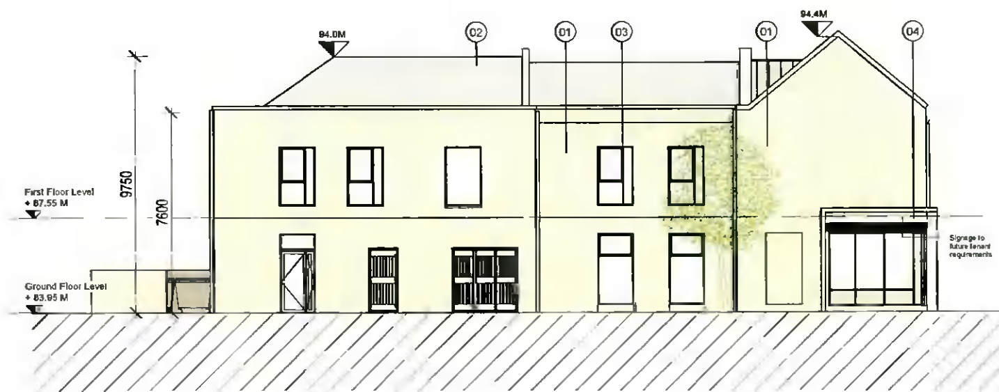
Block D2 - North Elevation - As Constructed