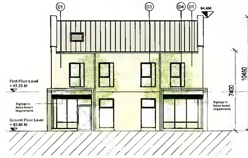
Block D2 - West Elevation - As Constructed