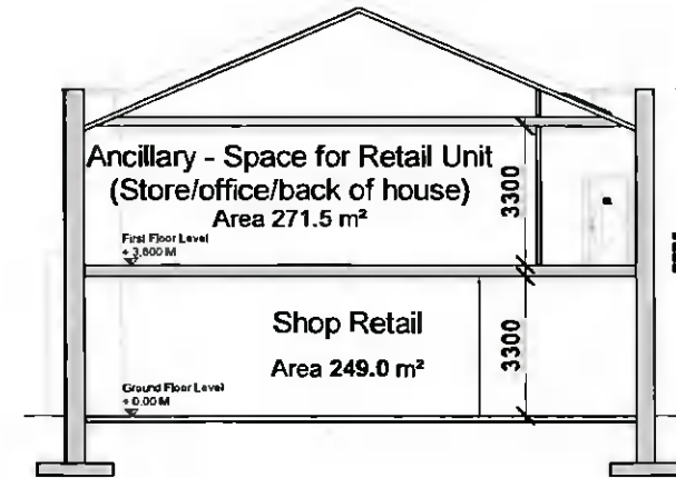
Block D2 - Proposed Cross Section