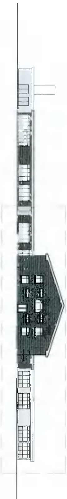
Existing Side (North-East) Key Elevation