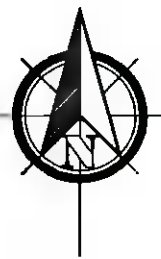
Site Layout Plan Scale 1:250