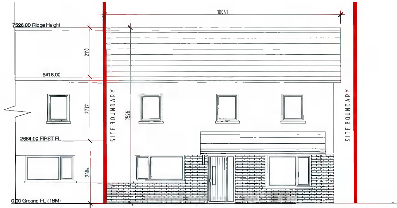
Retained South Elevation (no Change)