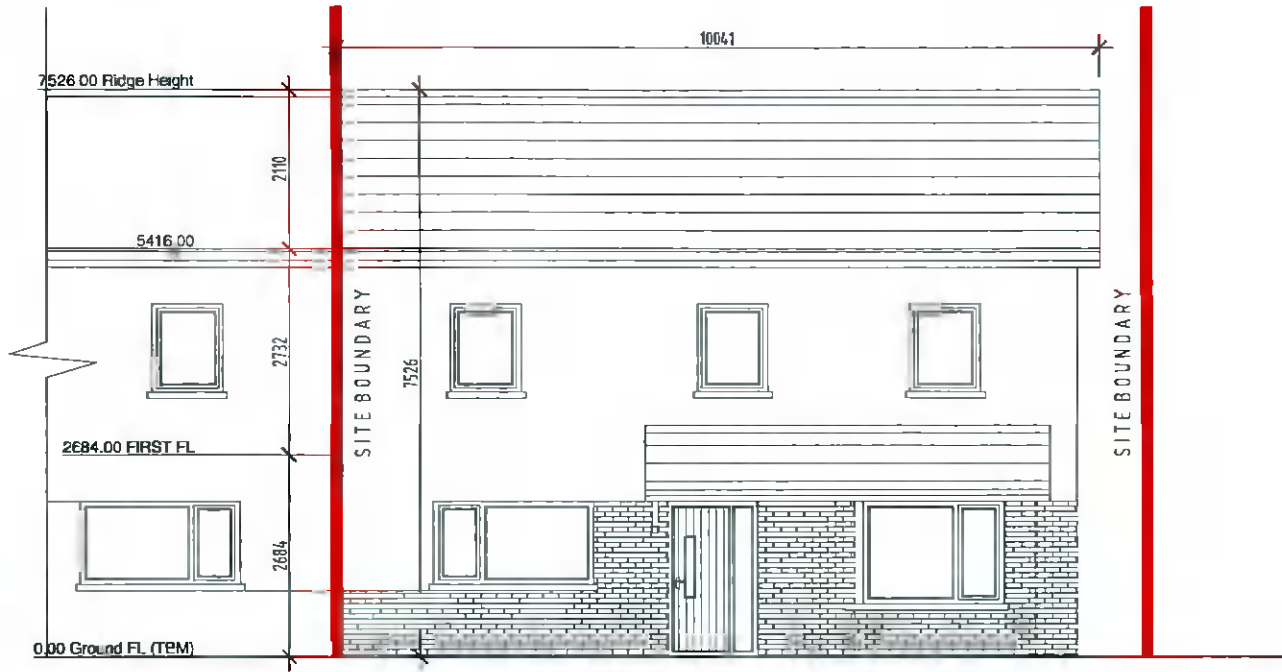
Original South Elevation Scale 1:100