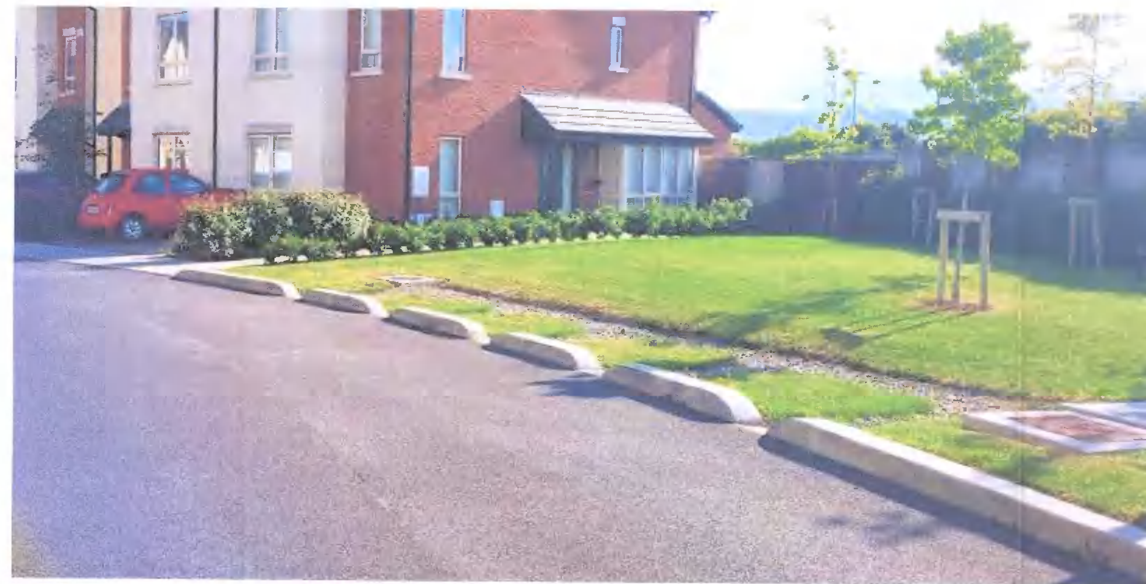
TYPICAL ROAD SIDE FILTER STRIP DETAIL WITH DROPPED KERBS