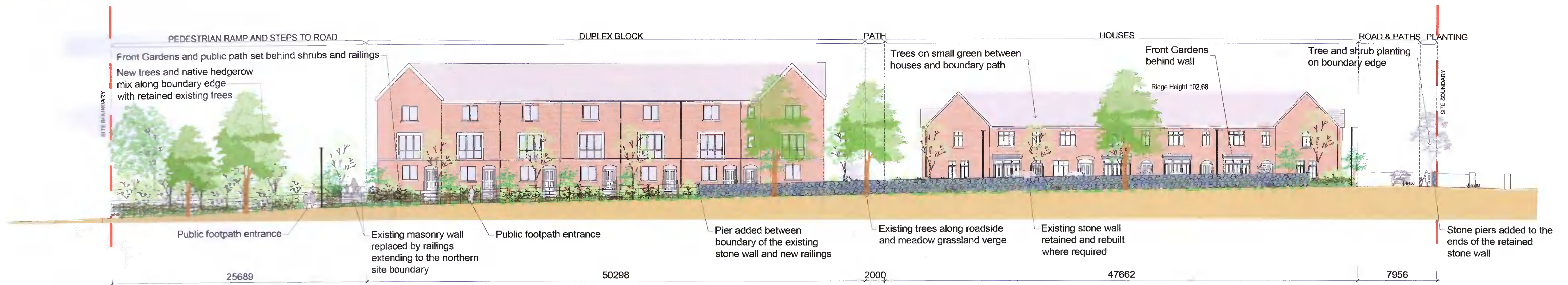
ELEVATION A-A - OLD NAAS ROAD SCALE: 1/200@ A1