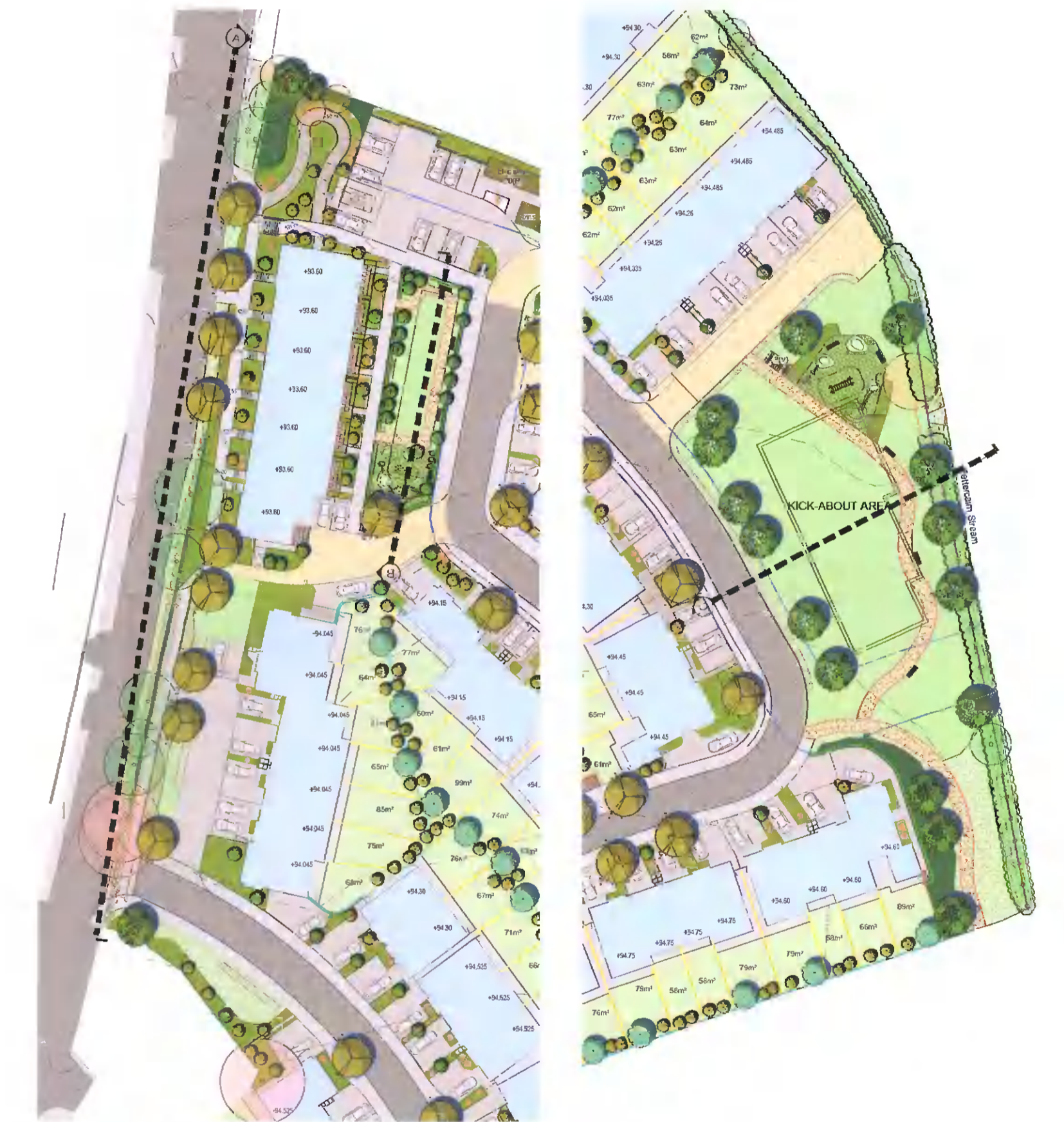
WESTERN END SECTIONS A-A and B-B KEY PLANS NTS @ A1 EASTERN END SECTION C-C