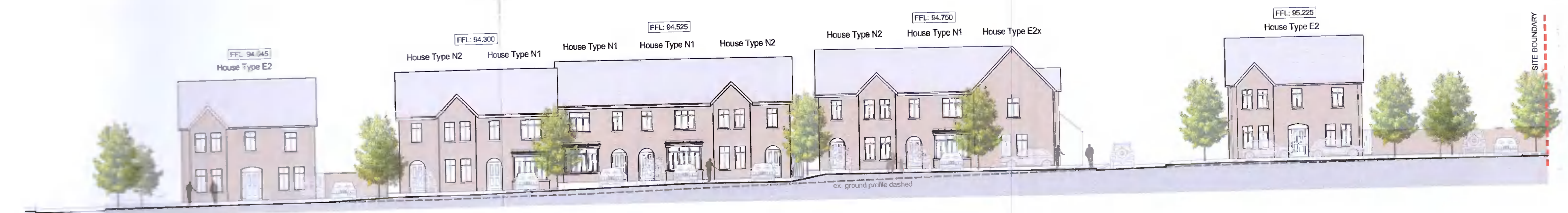
Site Elevation D-D