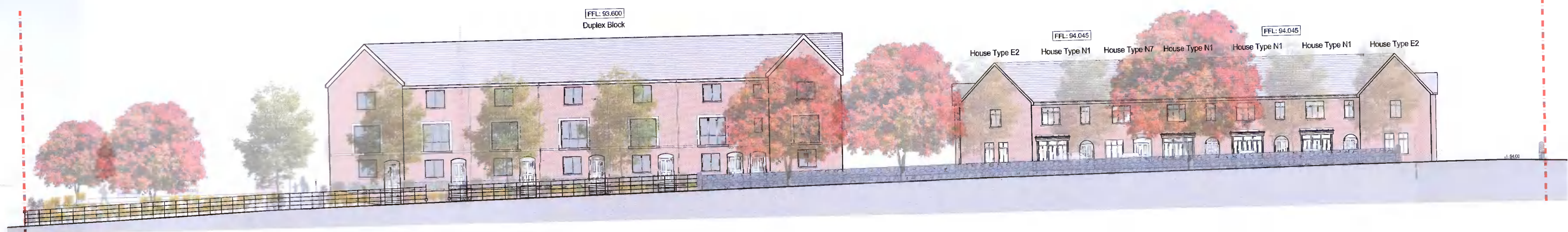
Site Elevation A-A

This drawing to be read in conjunction with Cunnane Stratton Reynolds Landscape Architects' Drawings.