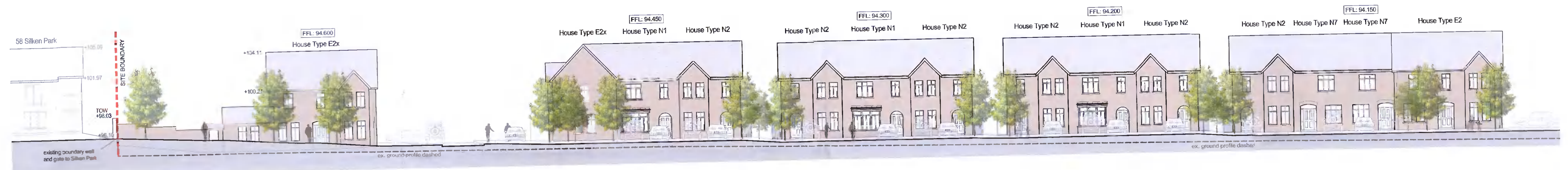
Site Elevation B-B