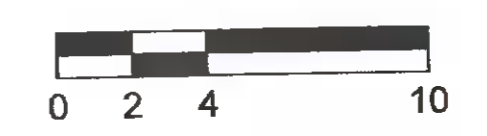
South Elevation Scale 1:200 @ A1