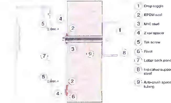
Typical through section (NTS)