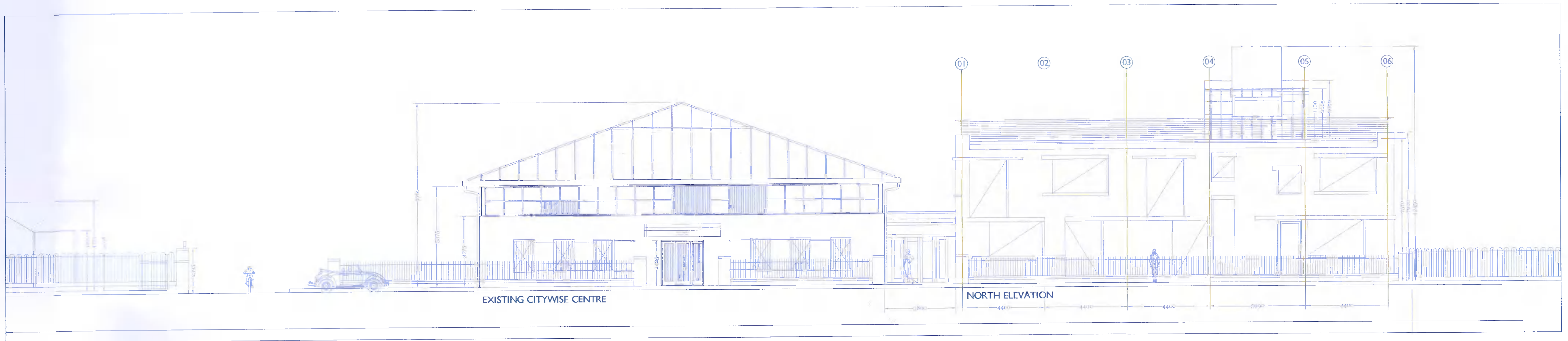
NORTH ELEVATION 1-100