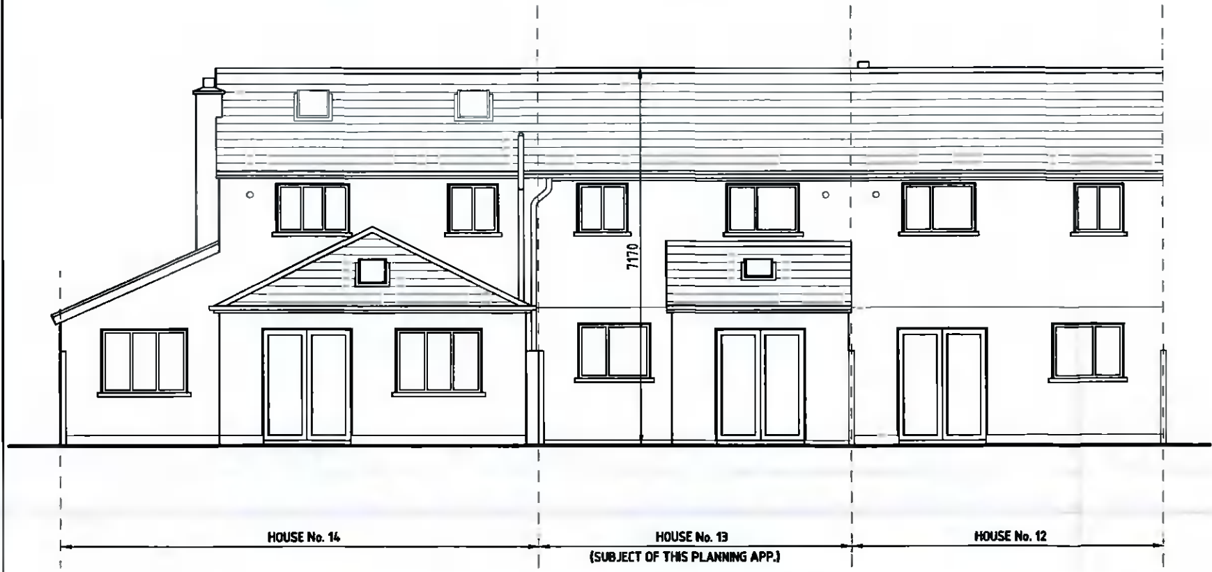
Existing Rear Elevation (West) Contiguous. Scale 1:100