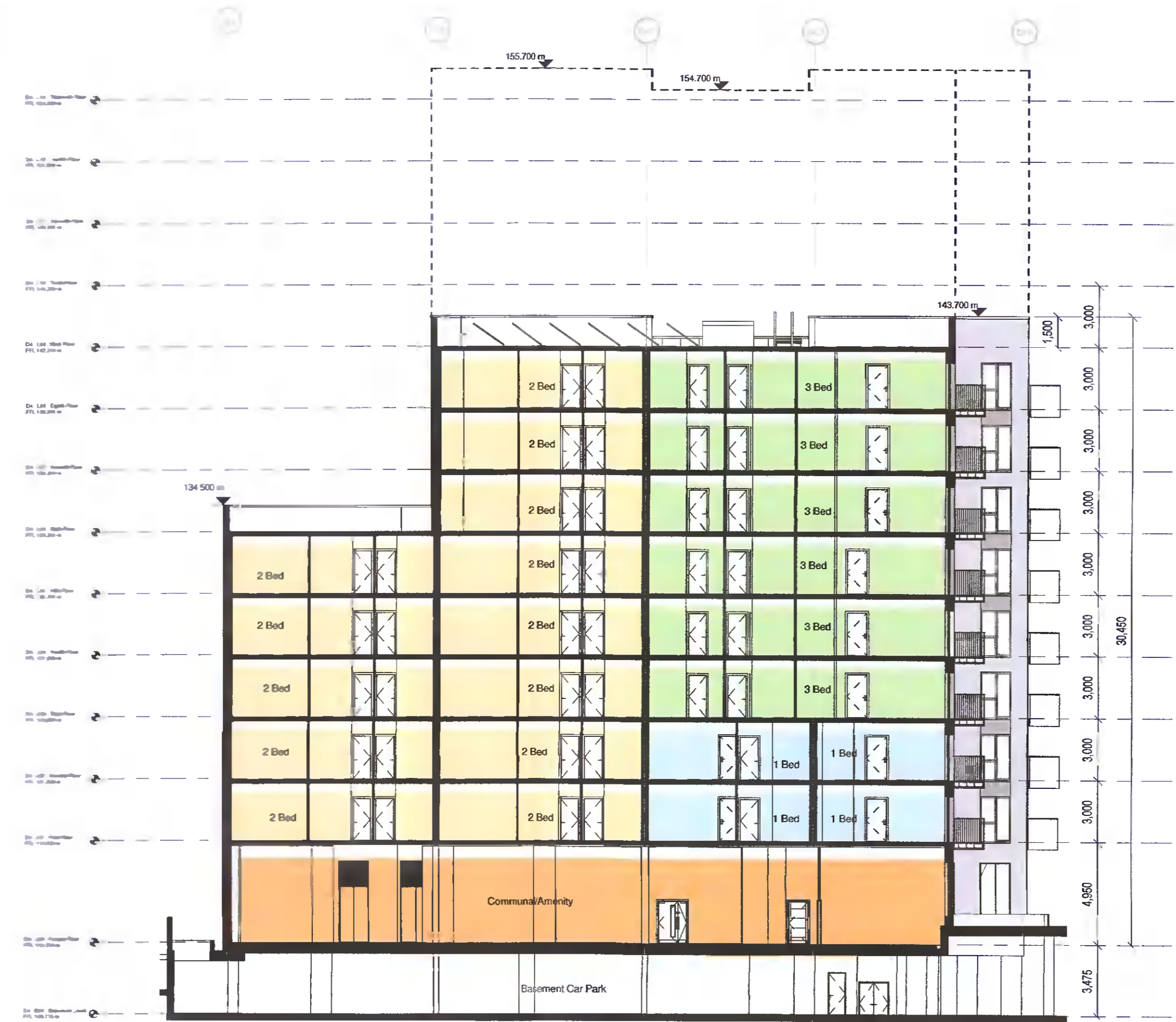
PROPOSED SECTION - BLOCK D4 - LONGITUDINAL 1 : 200