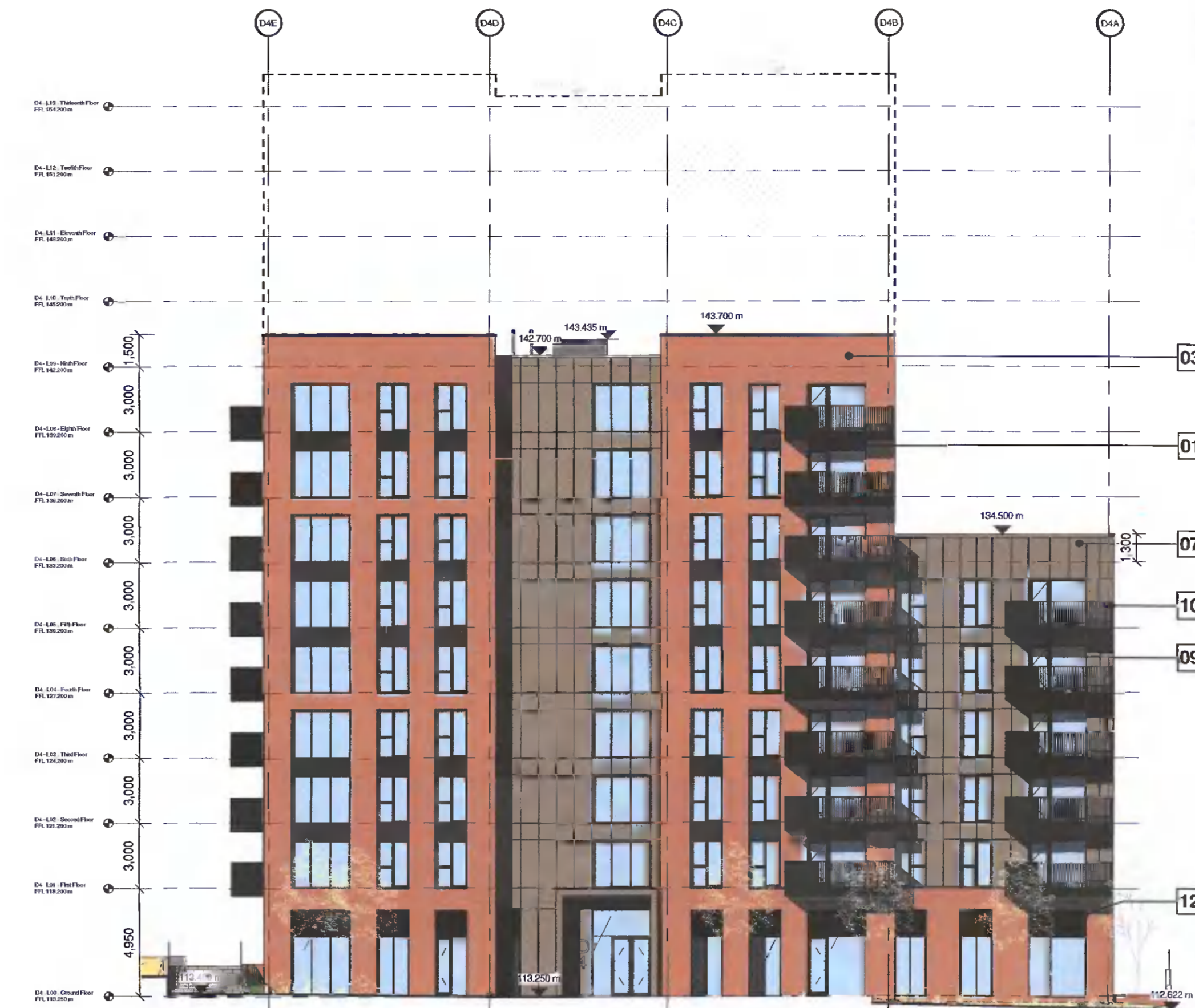
2 Proposed Block D4 - East Elevation 1 : 200