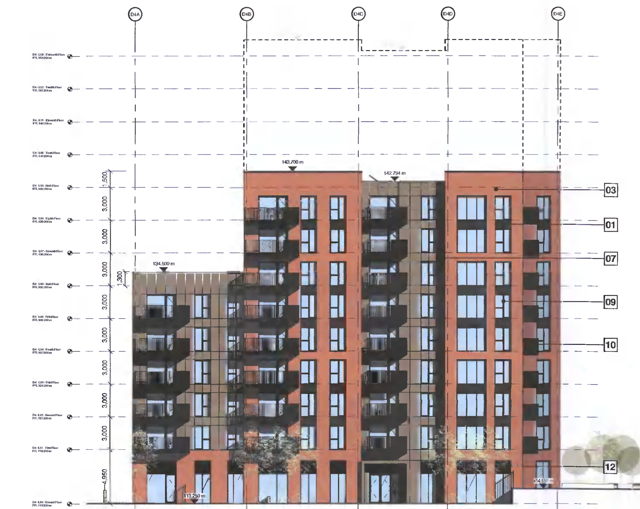
4 Proposed Block D4 - West Elevation 1 : 200

INDEX Site Boundary to Which Application Relates SIID Site Outline previously approved scheme Reg Ref ABP - 310570 - 21 - Section Extent of height previously approved scheme Reg Ref ABP - 310570 - 21 Approved Scheme re alteration Reg Ref ABP - 310570 - 21 SIID Site Outline previously approved scheme Reg Ref ABP - 310570 - 21 - Elevation Elevation: Flat - Angle Change as Indicated Angle Change