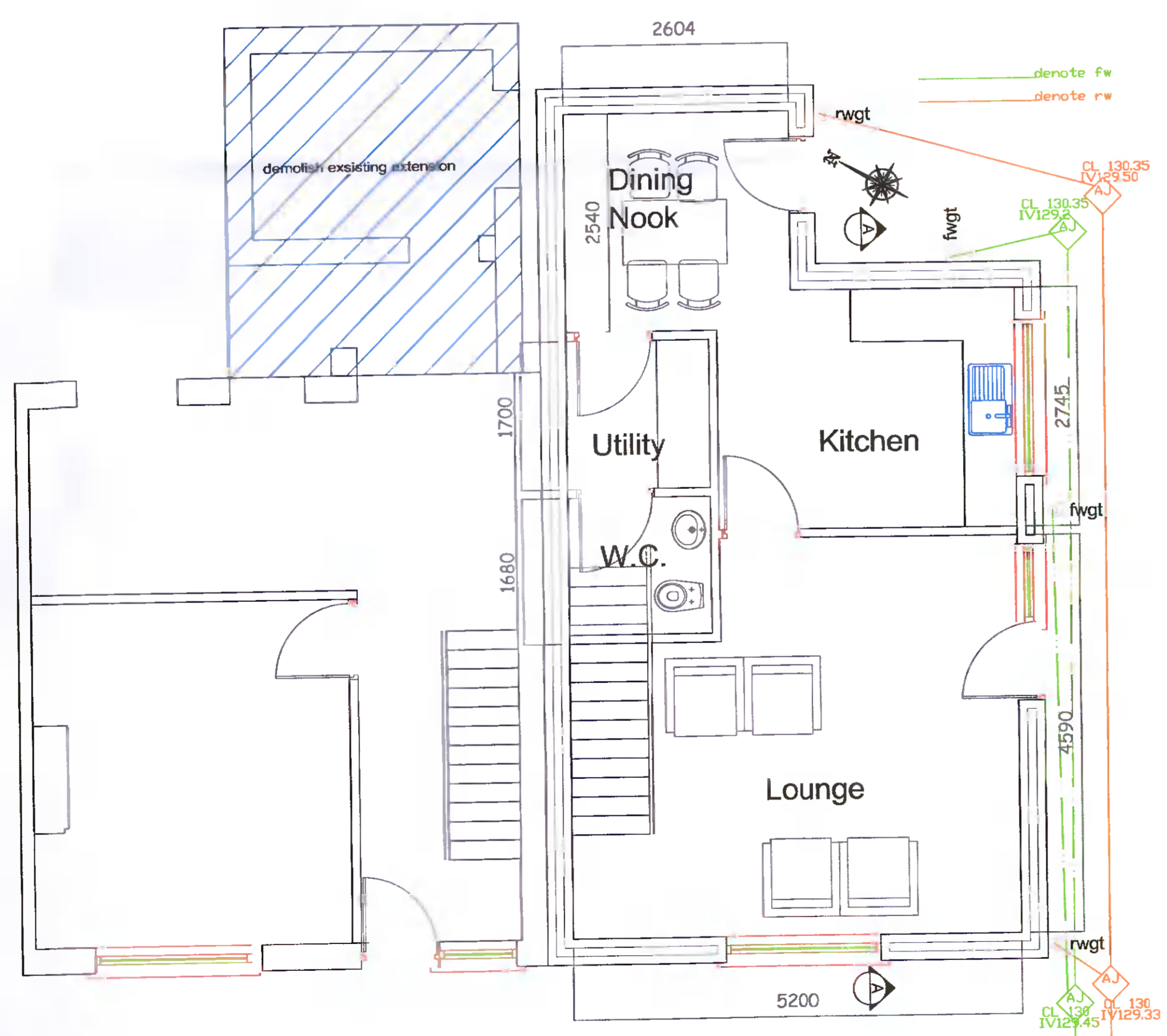
proposed ground floor plan Scale 1:50