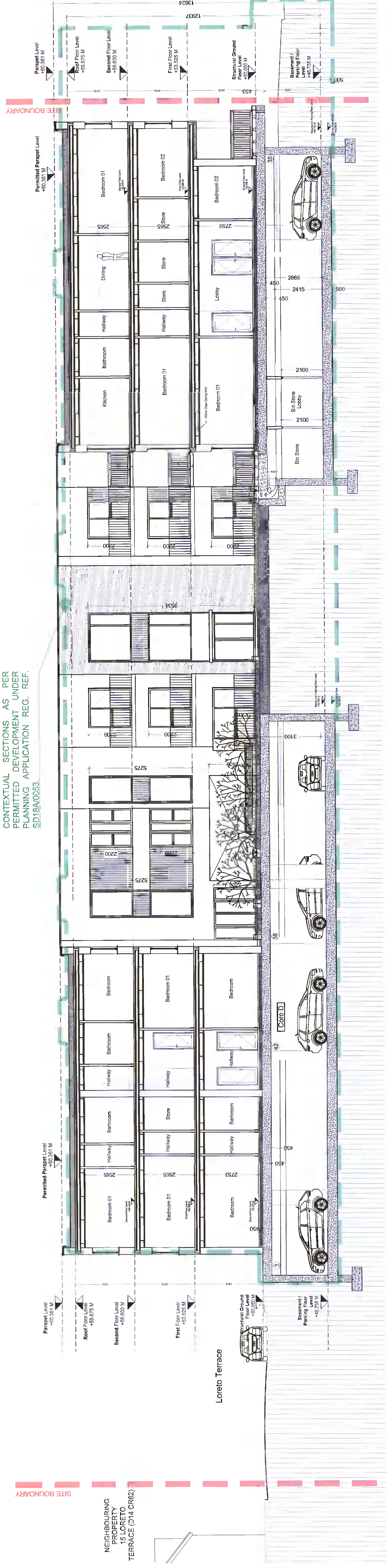
PROPOSED NEW CONTEXTUAL SECTION CC SCALE 1:100

NEIGHBOURING PROPERTY 15 LORETO TERRACE (D14/CR/2)