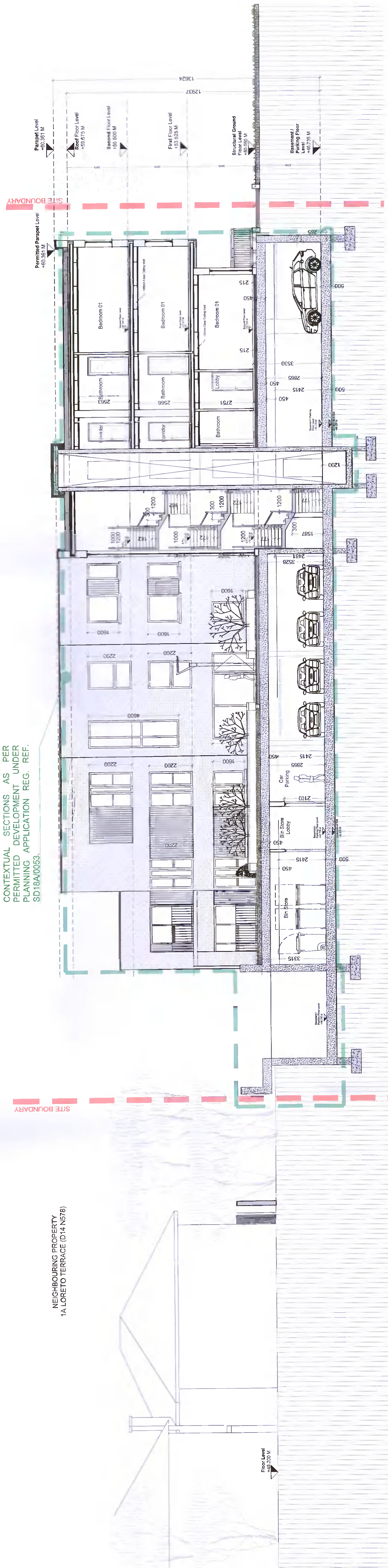
PROPOSED NEW CONTEXTUAL SECTION AA SCALE 1:100

NEIGHBOURING PROPERTY 1A LORETO TERRACE (D14/NS/18)