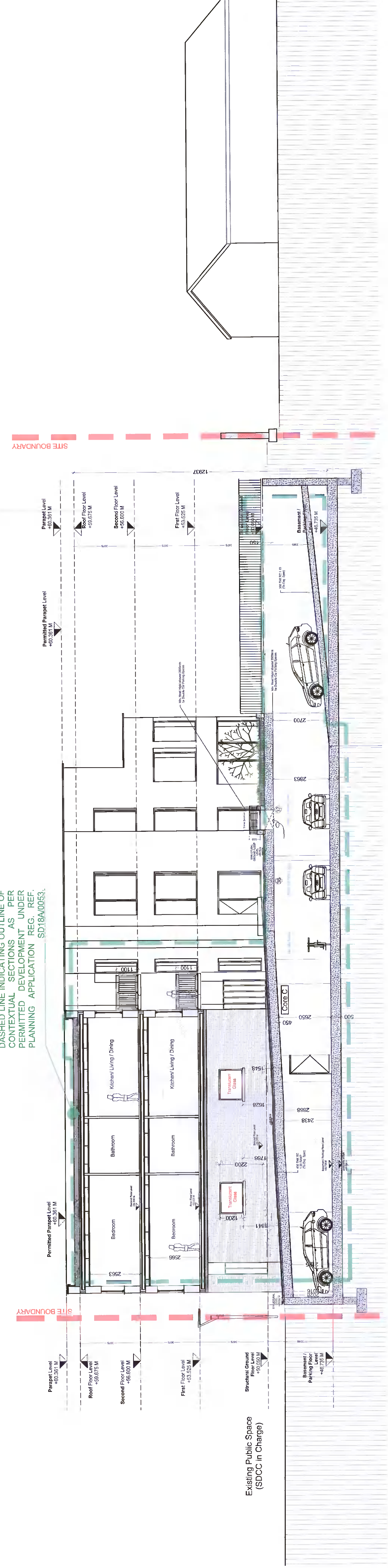
PROPOSED NEW CONTEXTUAL SECTION BB SCALE 1:100

DASHED LINE INDICATING OUTLINE OF CONTEXTUAL SECTIONS AS PERMITTED DEVELOPMENT UNDER PLANNING APPLICATION REG. REF. SD/18A/0053.