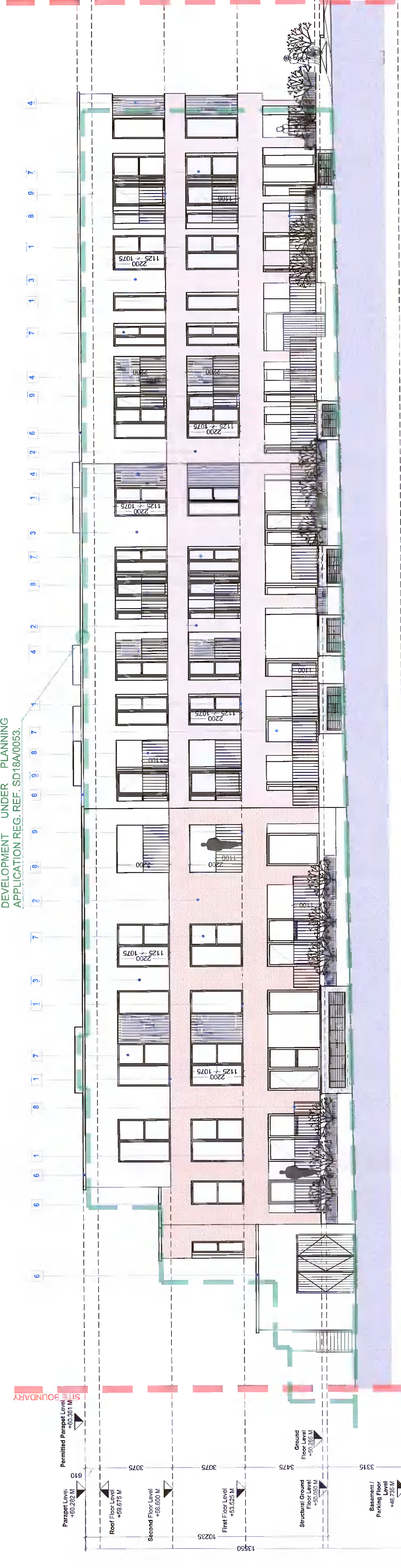
PROPOSED NEW NORTH ELEVATION SCALE 1:100

DASHED LINE INDICATING OUTLINE OF ELEVATION AS PERMITTED DEVELOPMENT UNDER PLANNING APPLICATION REG. REF. SD/18A0053.