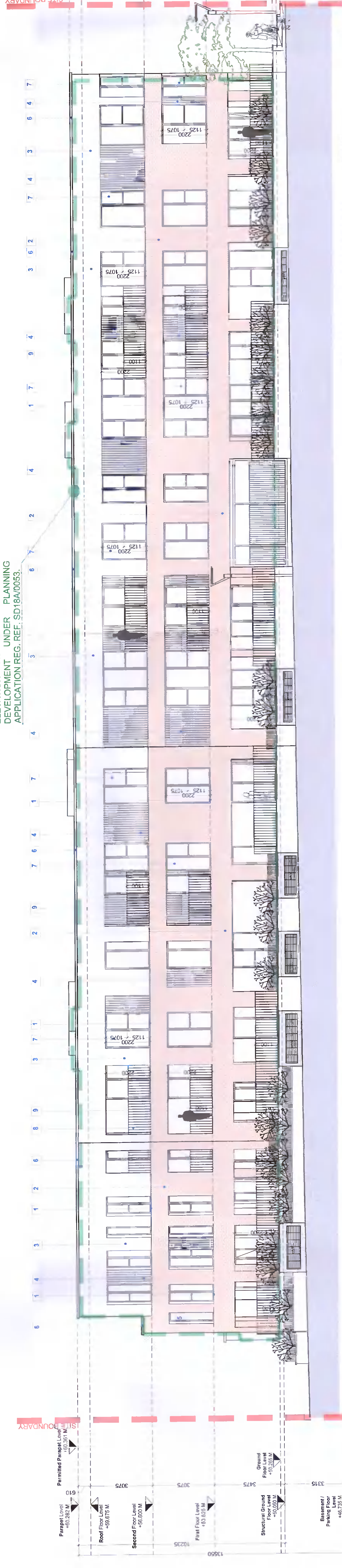
PROPOSED NEW NORTH-WEST ELEVATION SCALE 1:100

DASHED LINE INDICATING OUTLINE OF ELEVATION AS PERMITTED DEVELOPMENT UNDER PLANNING APPLICATION REG. REF. SD/18A0053.