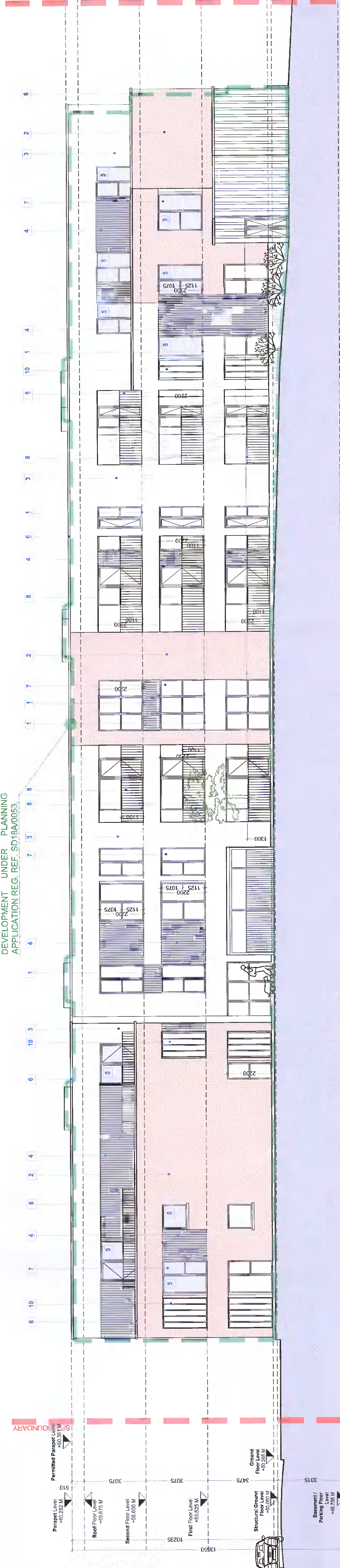
PROPOSED NEW SOUTH-EAST ELEVATION SCALE 1:100

DASHED LINE INDICATING OUTLINE OF ELEVATION AS PERMITTED DEVELOPMENT UNDER PLANNING APPLICATION REG. REF. SD/18A0053.