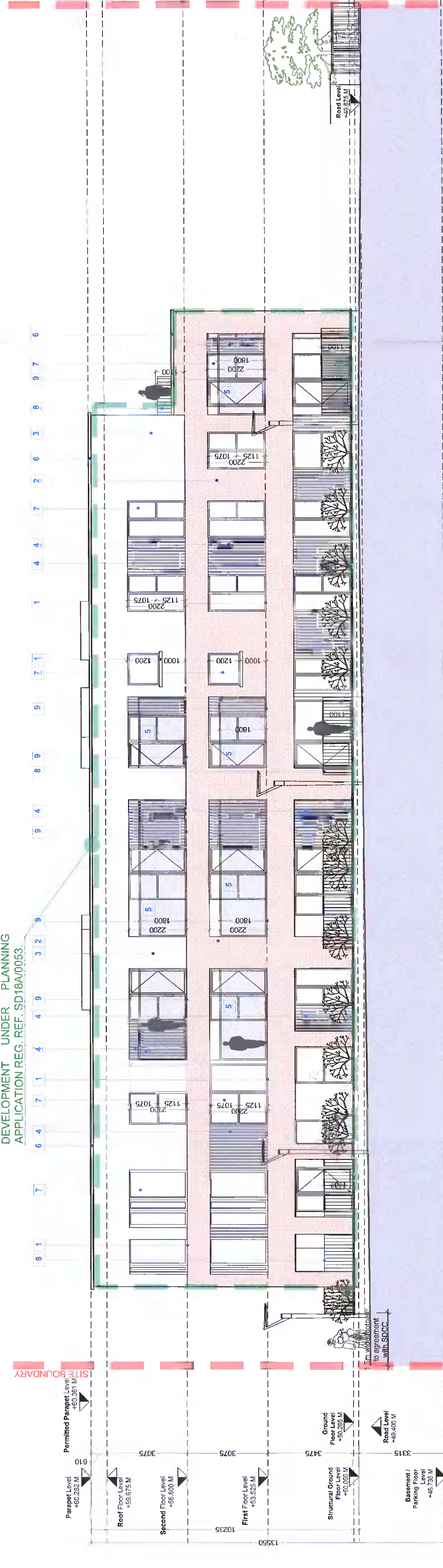
PROPOSED NEW SOUTH-WEST ELEVATION SCALE 1:100

DASHED LINE INDICATING OUTLINE OF ELEVATION AS PERMITTED DEVELOPMENT UNDER PLANNING APPLICATION REG. REF. SD/18A0053.