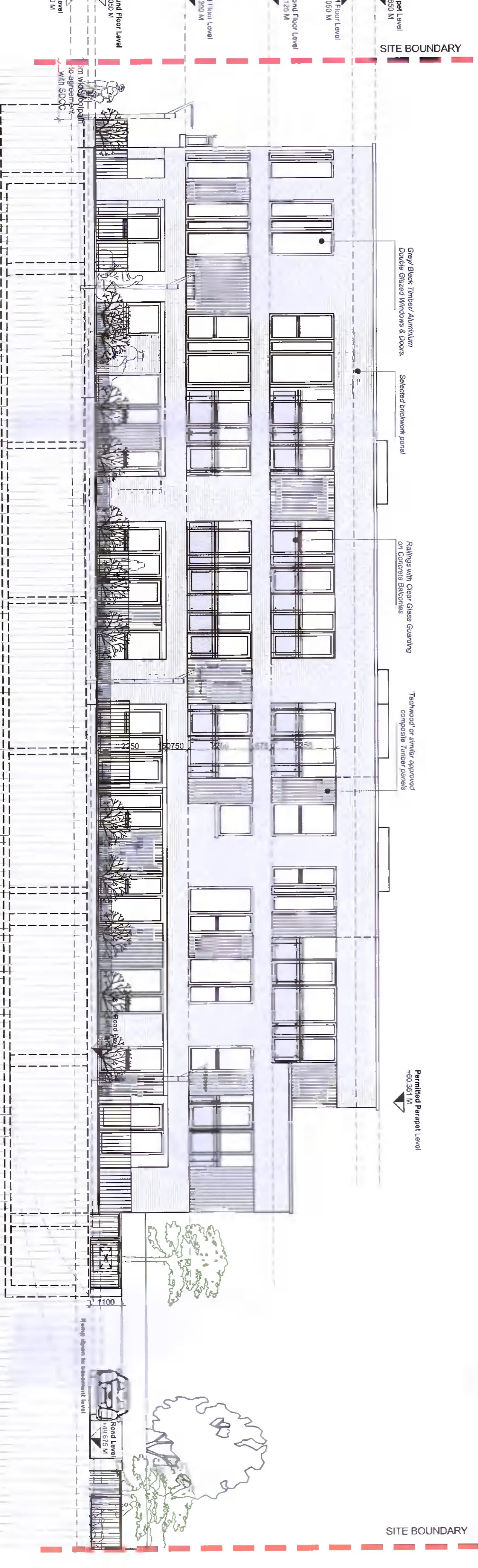
AS GRANTED PROPOSED SOUTH WEST ELEVATION SCALE 1:100