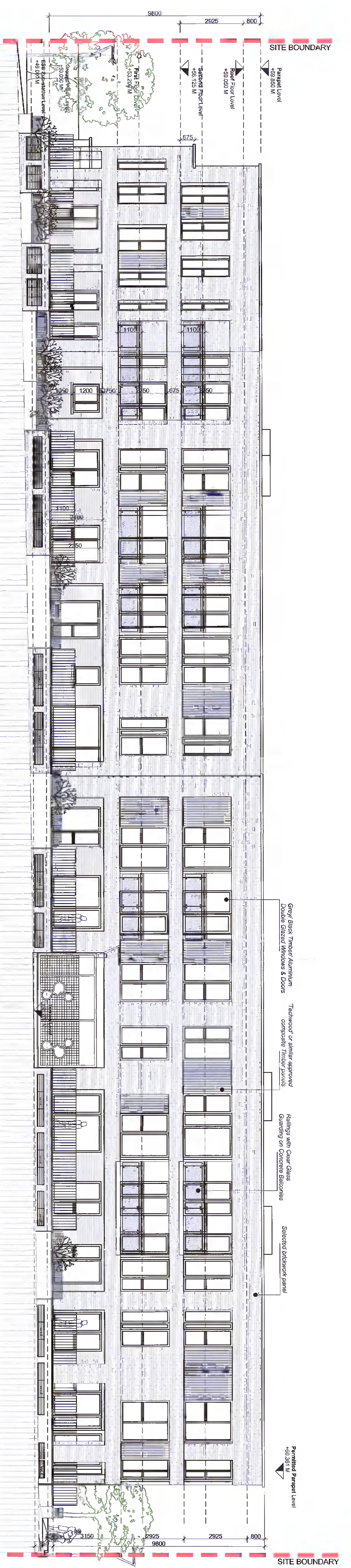
AS GRANTED PROPOSED NORTH WEST ELEVATION SCALE 1:100