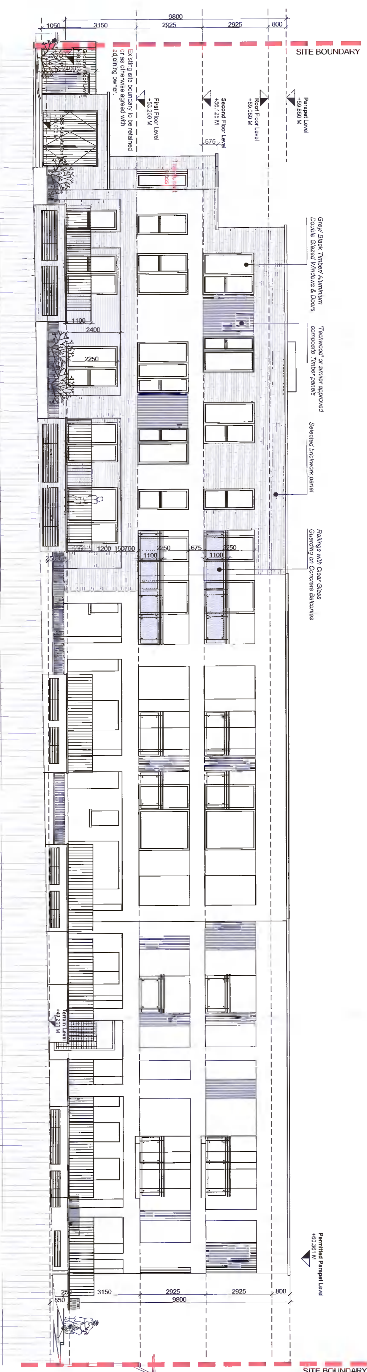
AS GRANTED PROPOSED NORTH ELEVATION SCALE 1:100