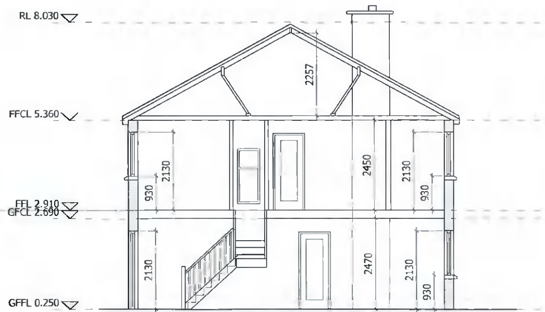
Existing Section A- A Scale 1 : 100