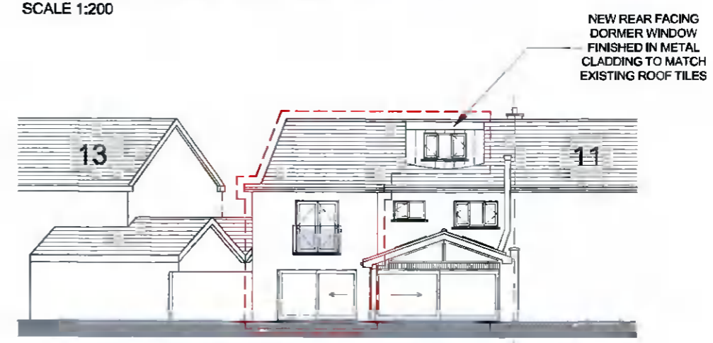
PROPOSED CONTEXTUAL REAR ELEVATION SCALE 1:200