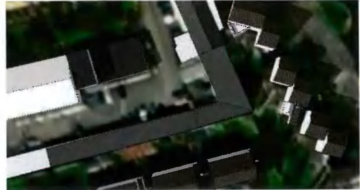
21st March 4pm - NEW UNITS