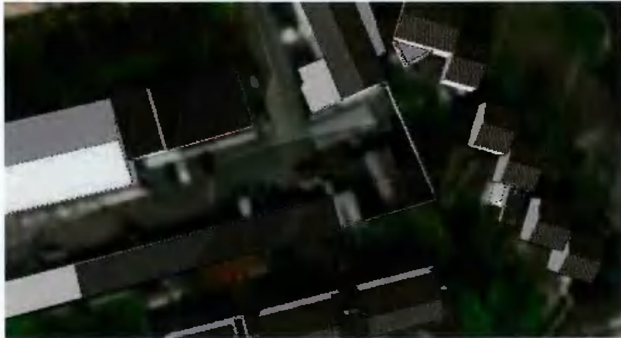
21st December 2pm - NO NEW UNITS