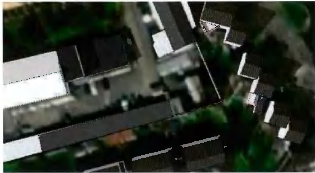
21st March 4pm - NO NEW UNITS