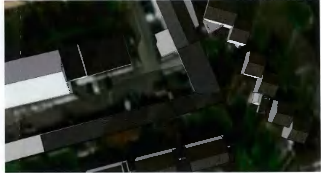
21st December 2pm - NEW UNITS

Notes This drawing and designs remains copyright to Gilna Architecture - all rights reserved. All Dimensions to be checked on site. No Dimensions to be scaled from the drawing. All Discrepancies to be notified to the Architect. All Work to be carried out in accordance with the Building Regulations and Relevant Codes of Practice. All dimensions to face of blockwork unless otherwise noted. This drawing to be read in conjunction with specification and consultants drawing.