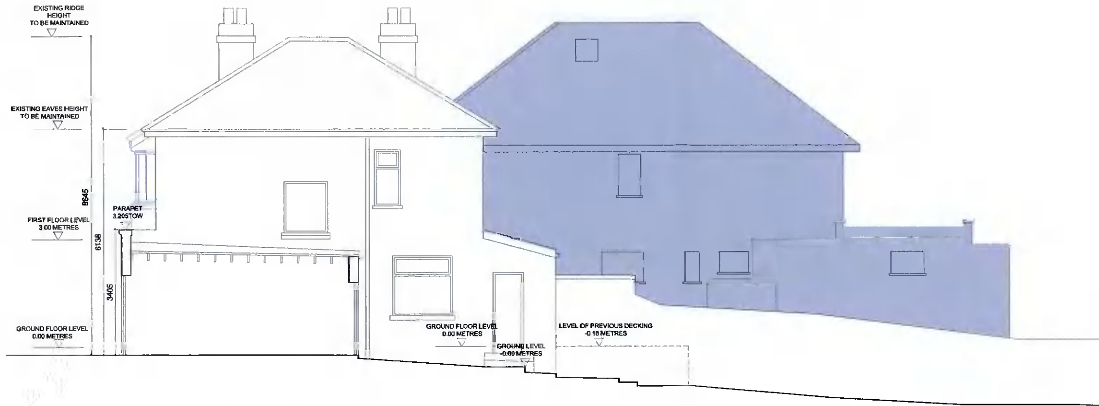
EXISTING LONGITUDINAL SECTION (B-B), Scale: 1/100