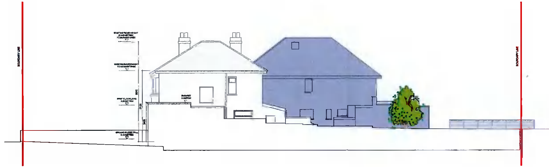
EXISTING EAST ELEVATION , Scale: 1/200