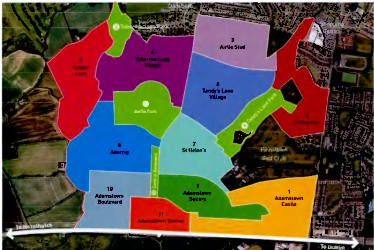
Figure 1a: The location of Adamstown District Centre (within Adamstown Station/Block 11) in Adamstown SDZ (Source: Planning Scheme documentation).

The location of the proposed development is shown in Figures 1a and 1b.