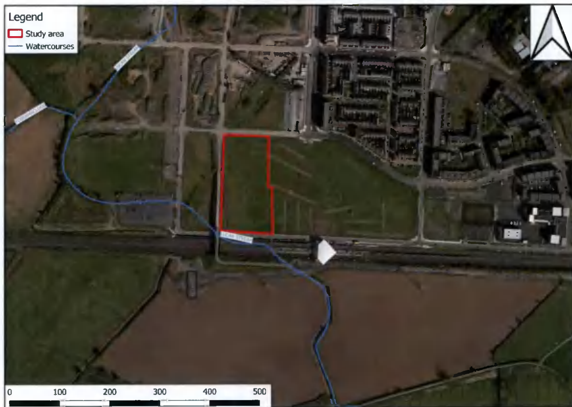
Figure 1b: Location of the proposed development site at Adamstown District Centre, with known watercourses also shown (red line shows indicative site area – refer to project documentation for full details)

There are 10 European sites potentially located within the zone of influence of the proposed development (see Figure 2 ). These are: