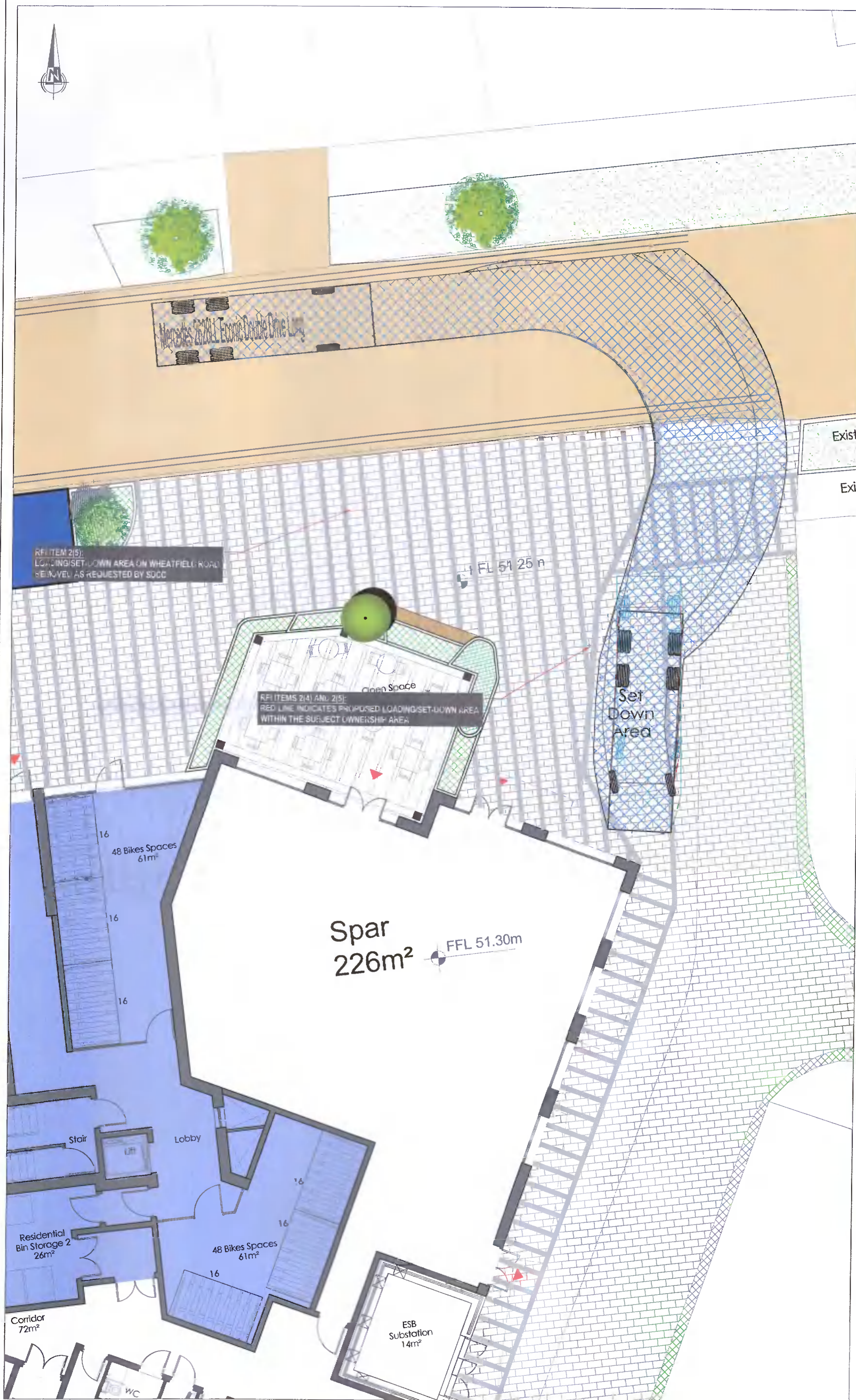
AUTOTRACK OF A LARGE REFUSE VEHICLE ENTERING THE LOADING/SET-DOWN AREA

NRB Consulting Engineers Ltd recommend that Road and land ownership boundaries are verified through Legal & Land searches by the Client. This drawing is based upon Downey Planning drawing S25-001-A1-001_Site Layout - Ground Floor Plan, received 12/04/22. NRB Consulting Engineers Ltd shall not be liable for any inaccuracies or deficiencies.