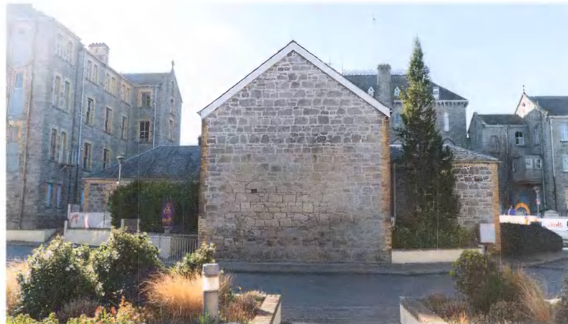
2 NORTHERN VIEW OF BUILDING NTS