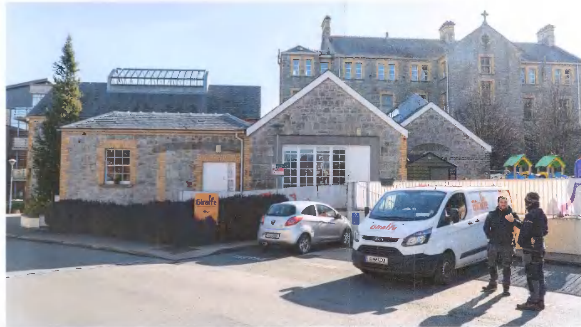
1 WESTERN VIEW OF BUILDING NTS