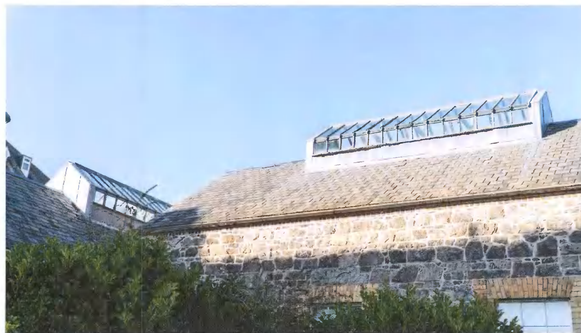
4 VIEW OF LANTERN ROOFLIGHTS NTS