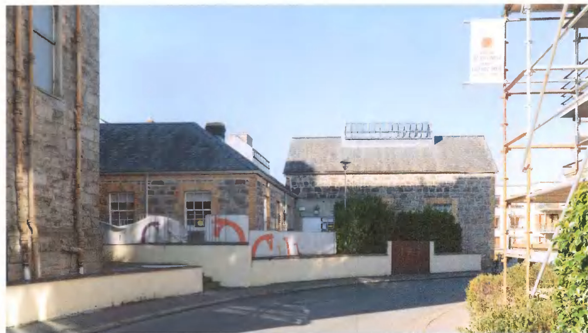
3 EASTERN VIEW OF BUILDING NTS