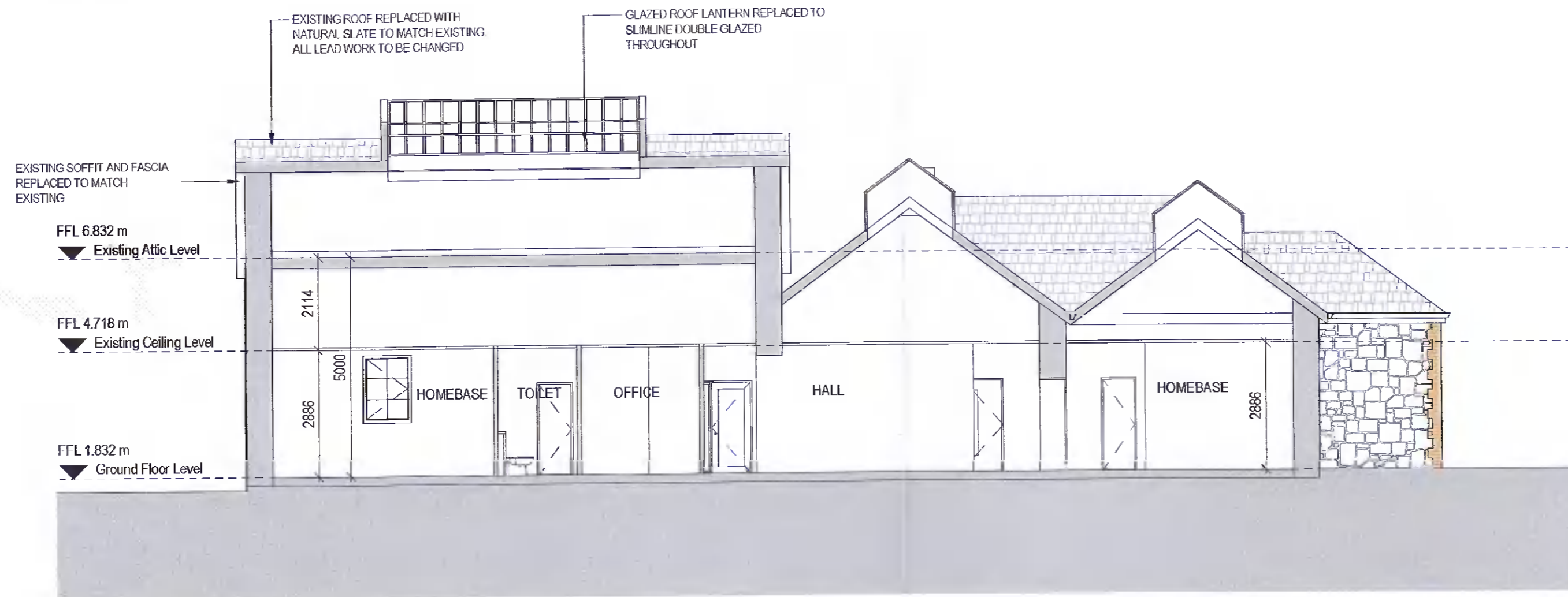
1 BUILDING SECTION A-A SCALE 1 : 100