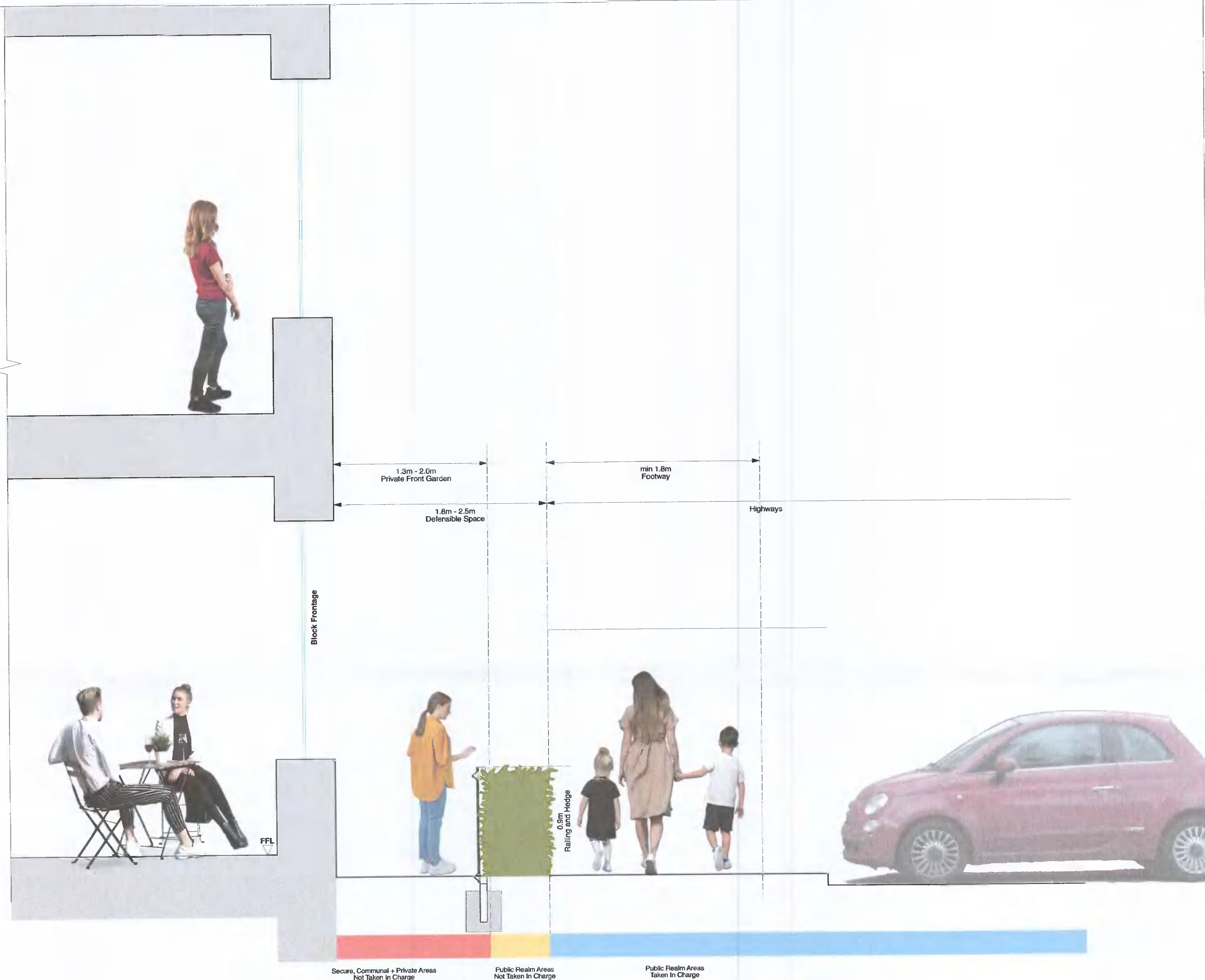
Section Through Block D, Private Front Garden & Public Realm Scale 1:20 at A1