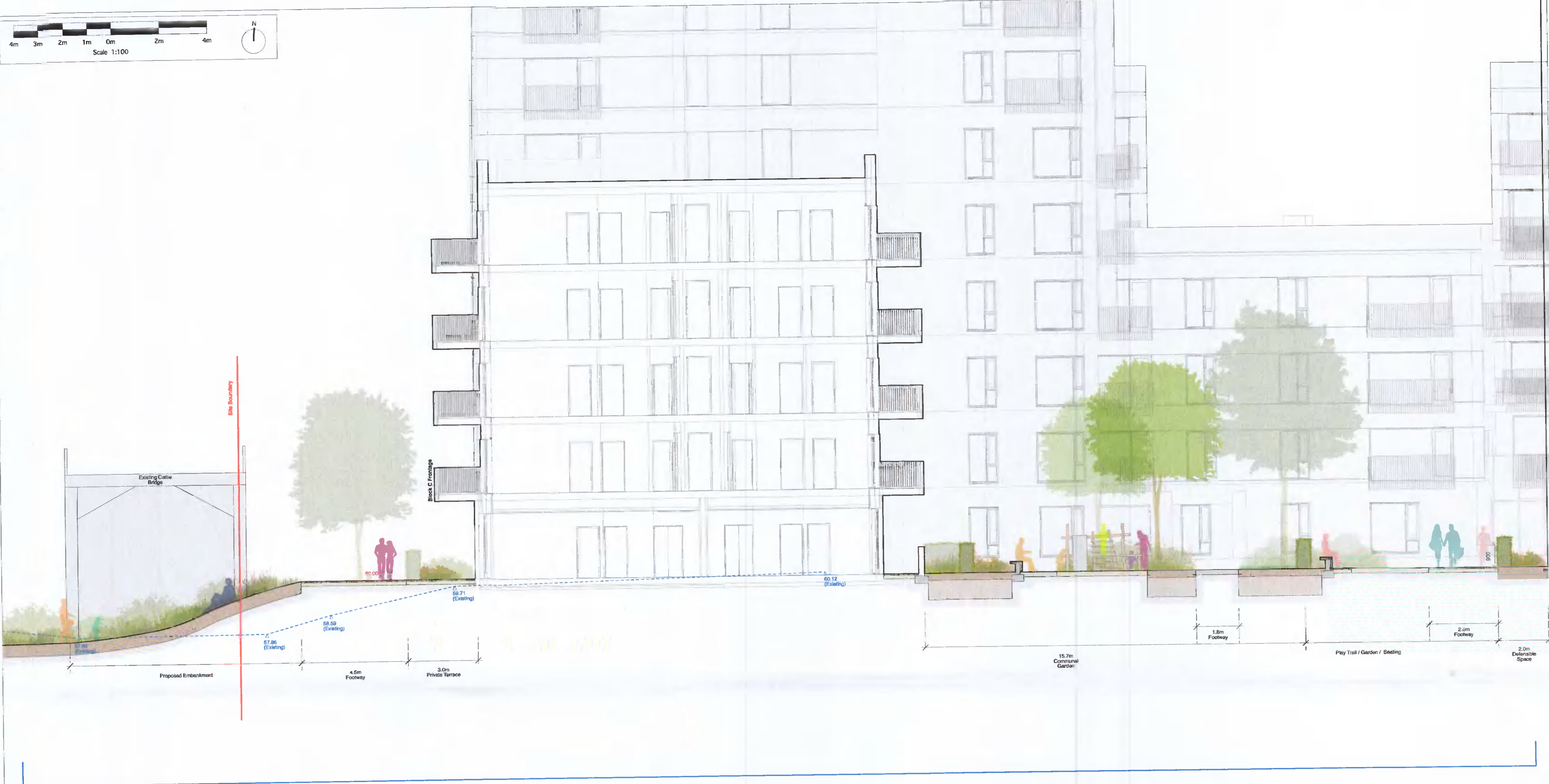
Section J (Scale 1:100)