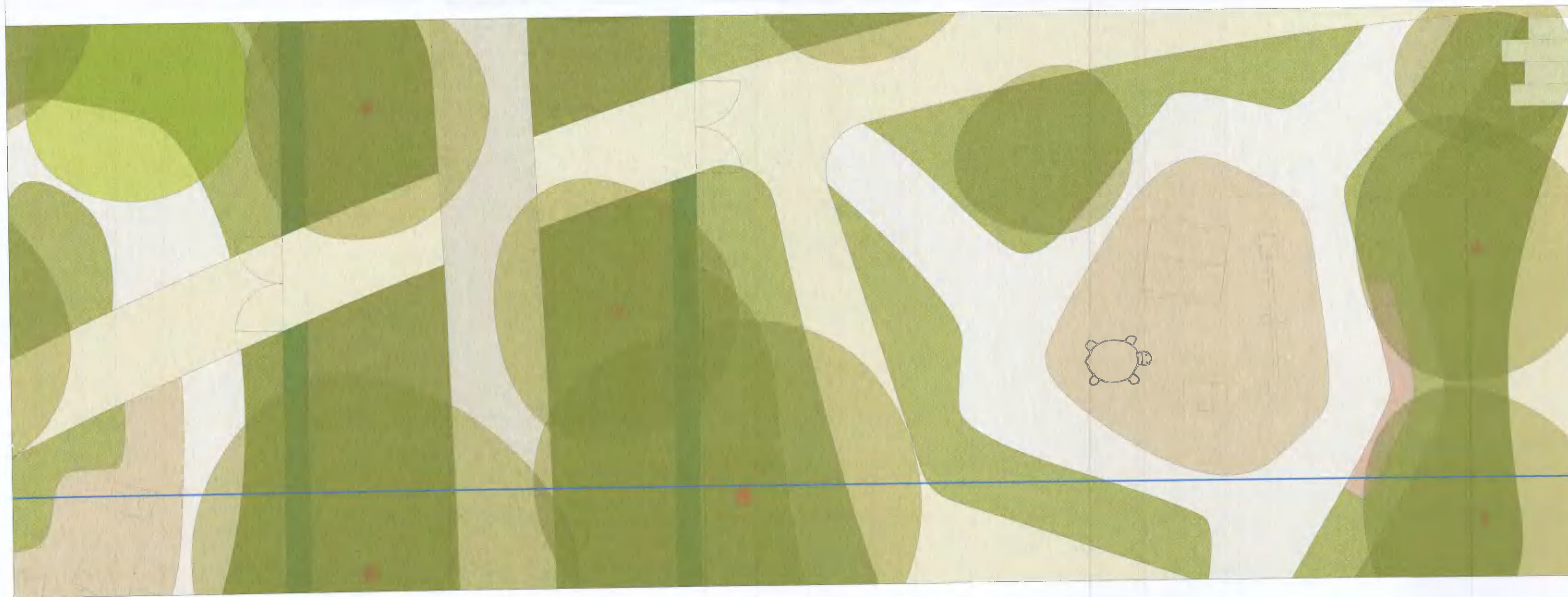
Section F Location Plan Scale 1:50 at A1