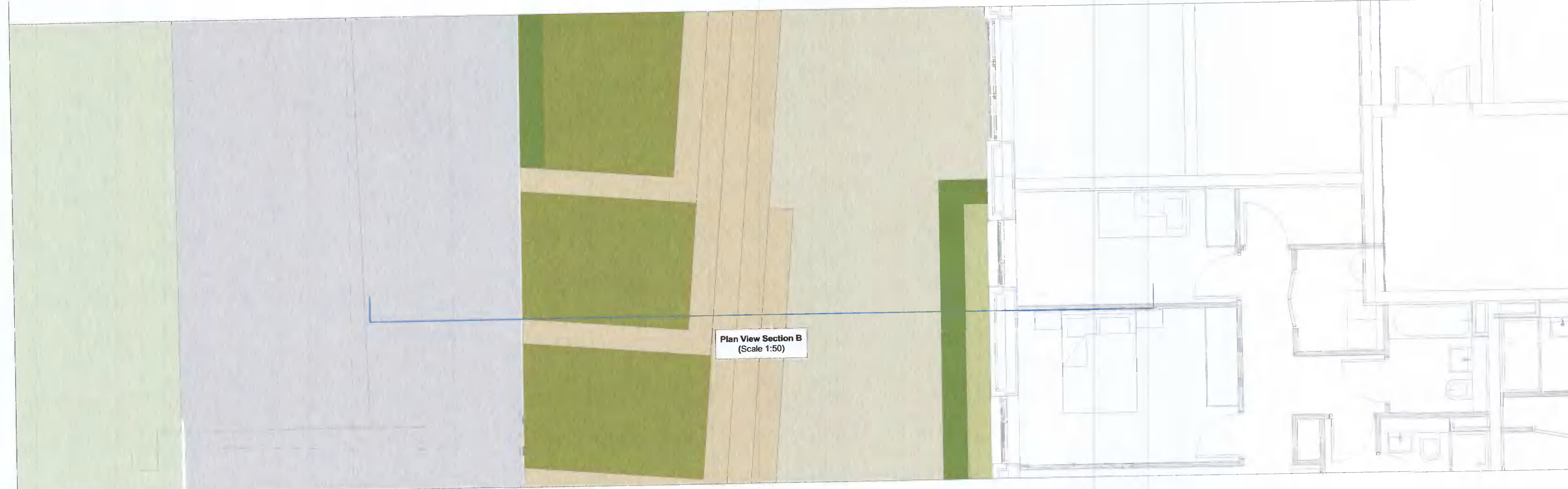
Plan View Section B (Scale 1:50)