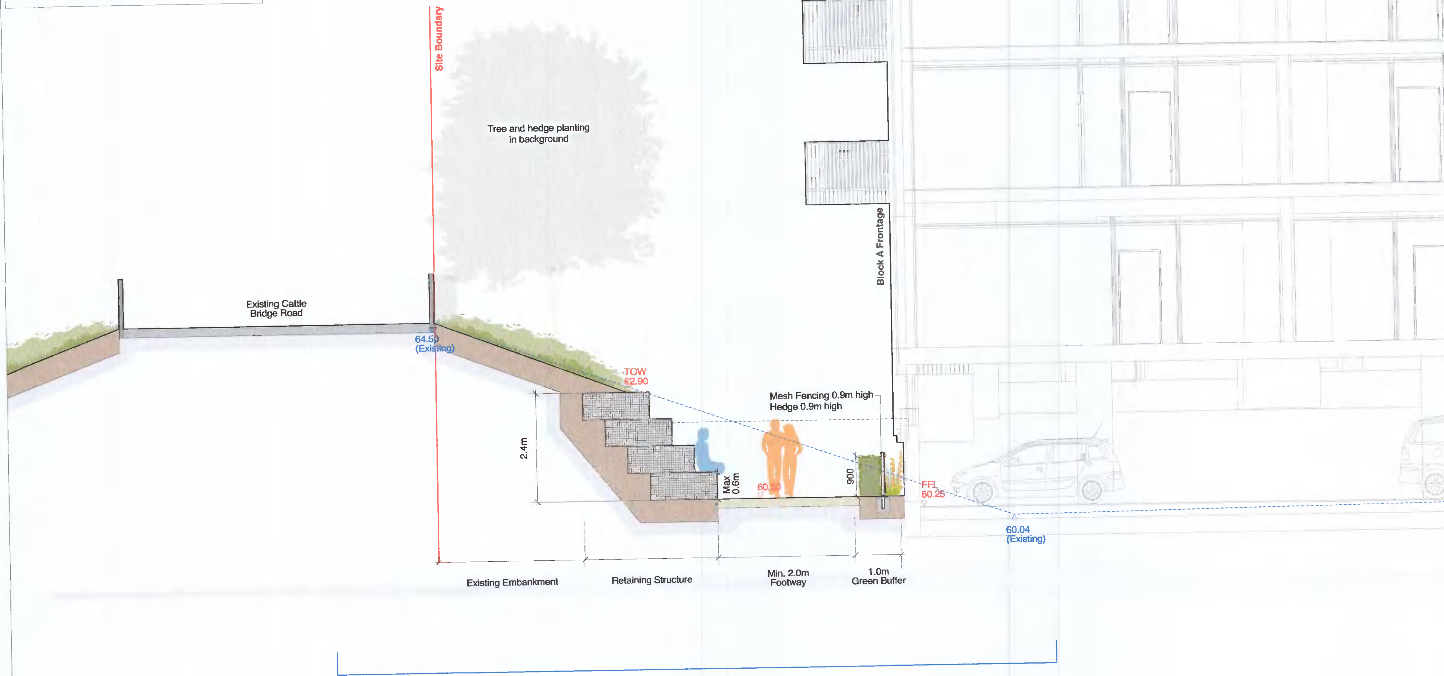
Section B (Scale 1:50)