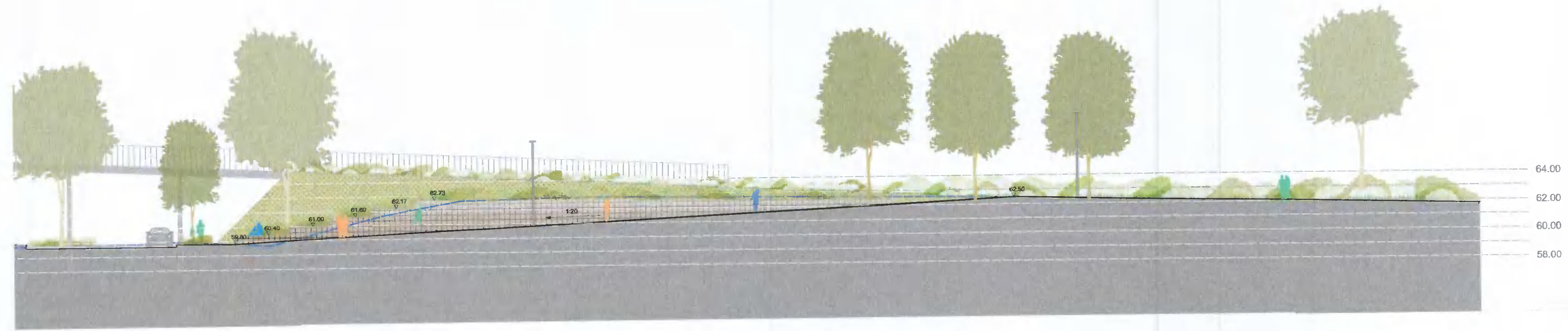
Section A (Scale 1:200)