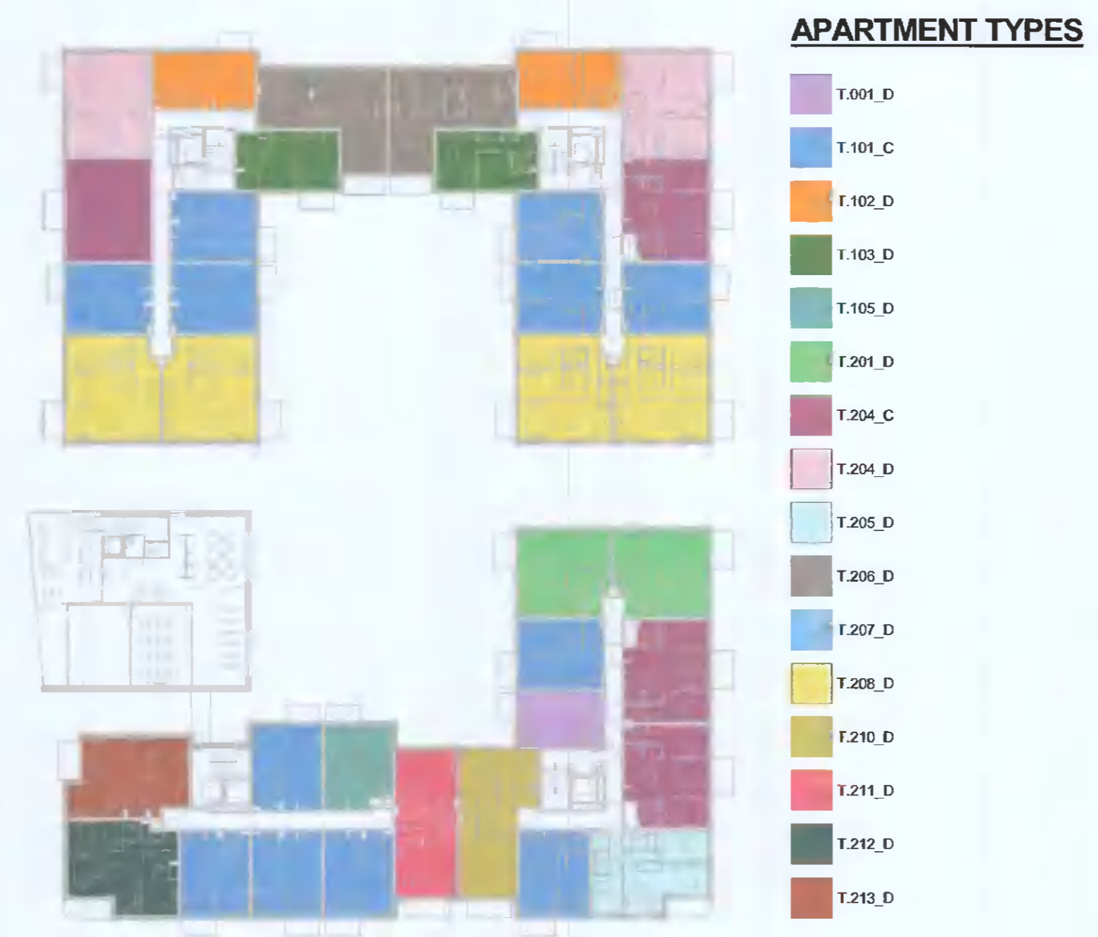
2 APT TYPES BLOCK D - LEVEL 01 1 : 500