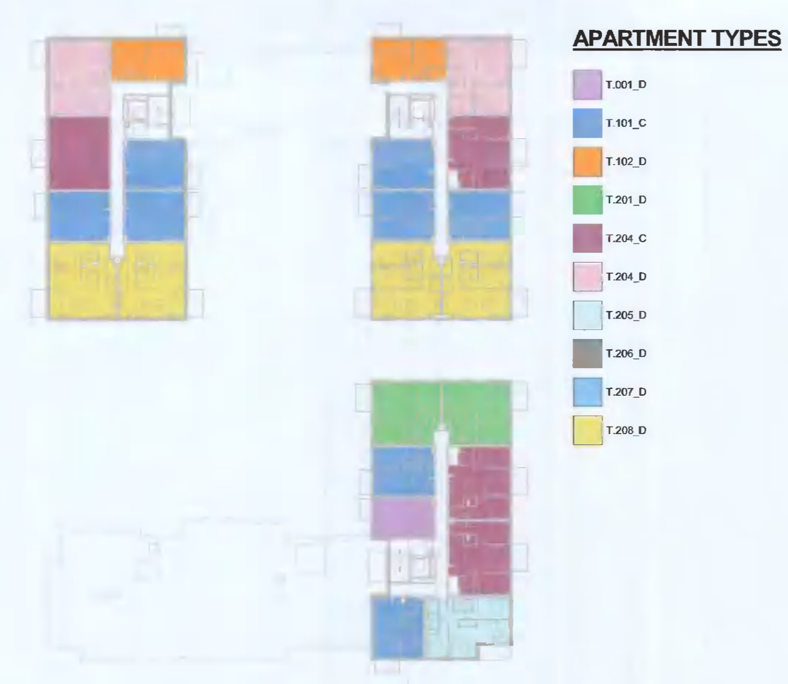
5 APT TYPES BLOCK D - LEVEL 04 1 : 500