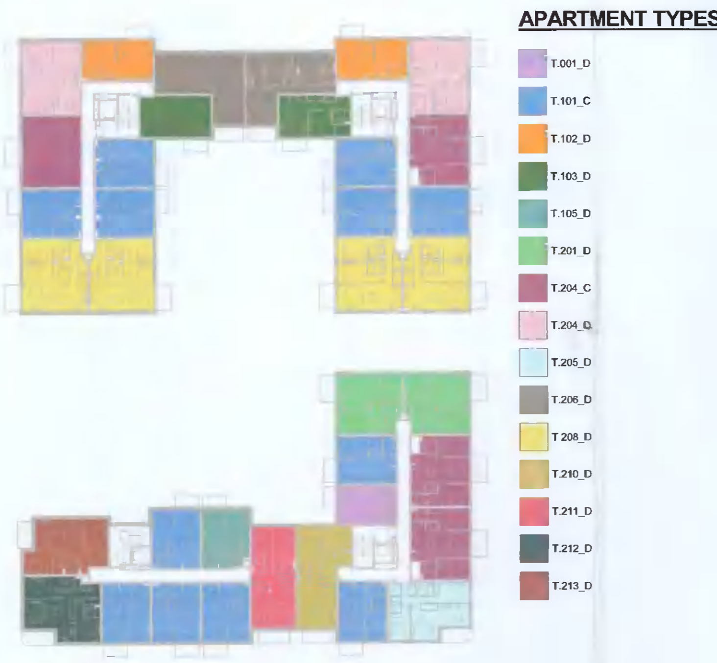
4 APT TYPES BLOCK D - LEVEL 03 1 : 500