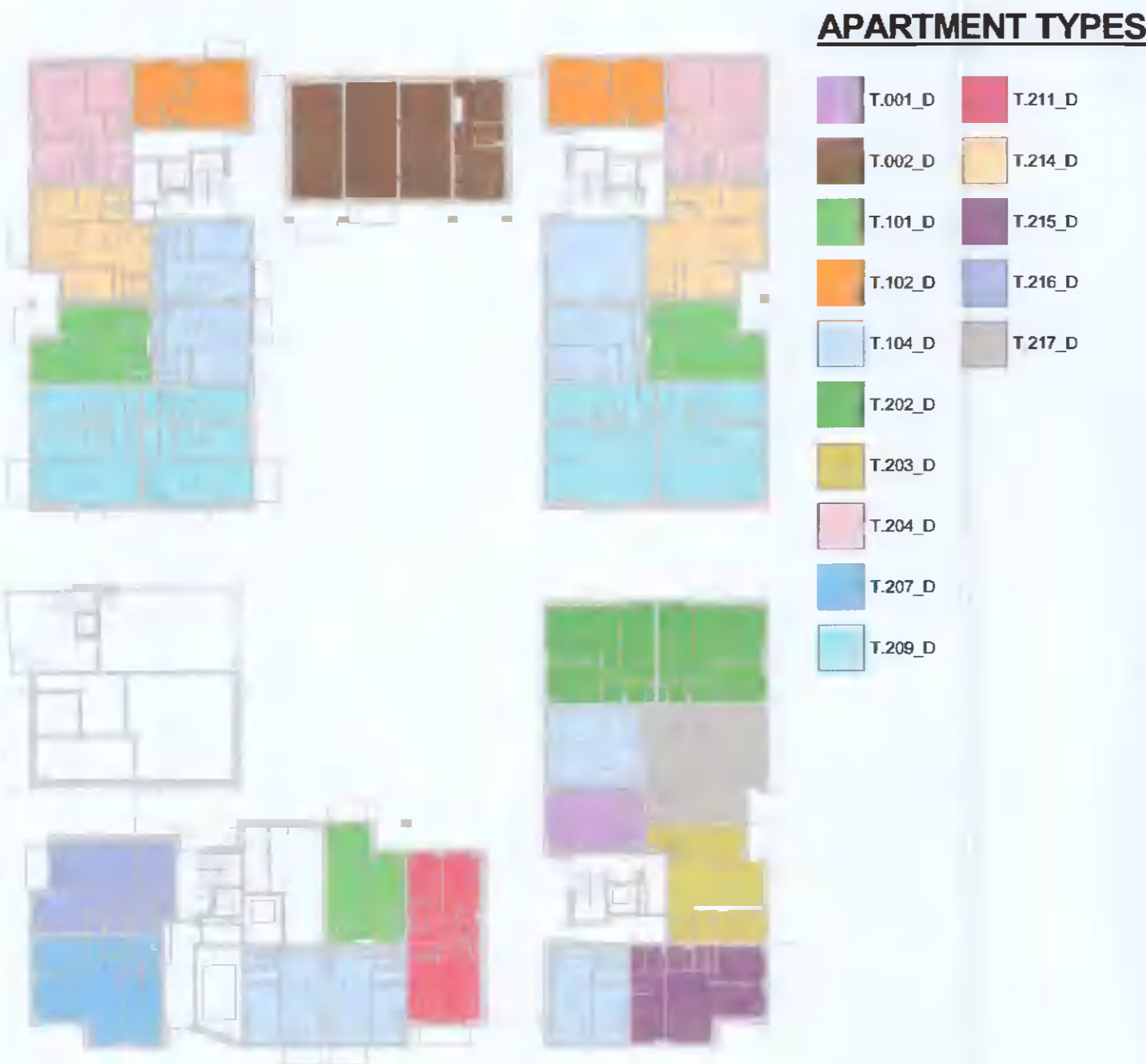
1 APT TYPES BLOCK D - LEVEL 00 1 : 500