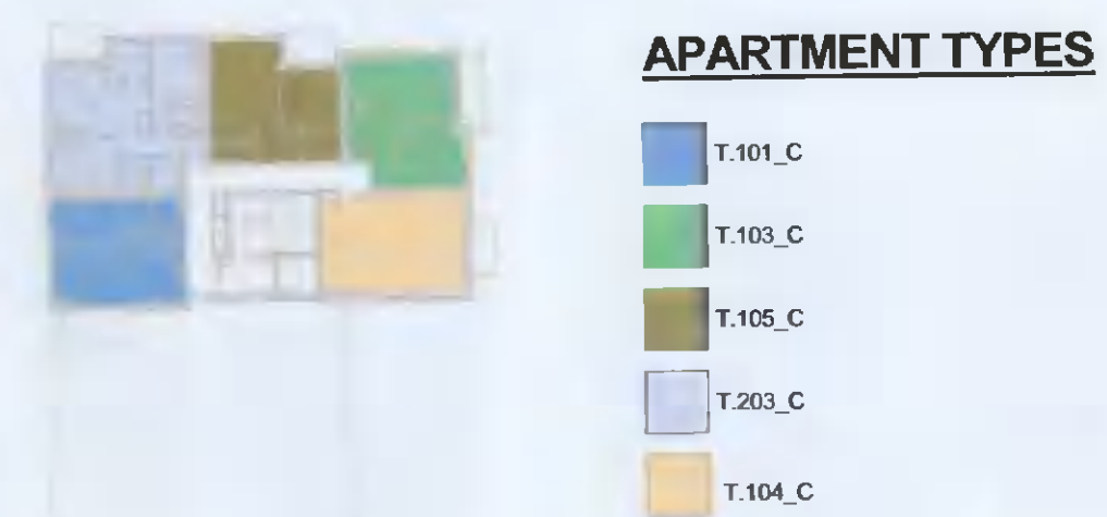
6 APT TYPES BLOCK C - LEVEL 05 1 : 500