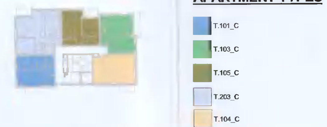
8 APT TYPES BLOCK C - LEVEL 07 1 : 500