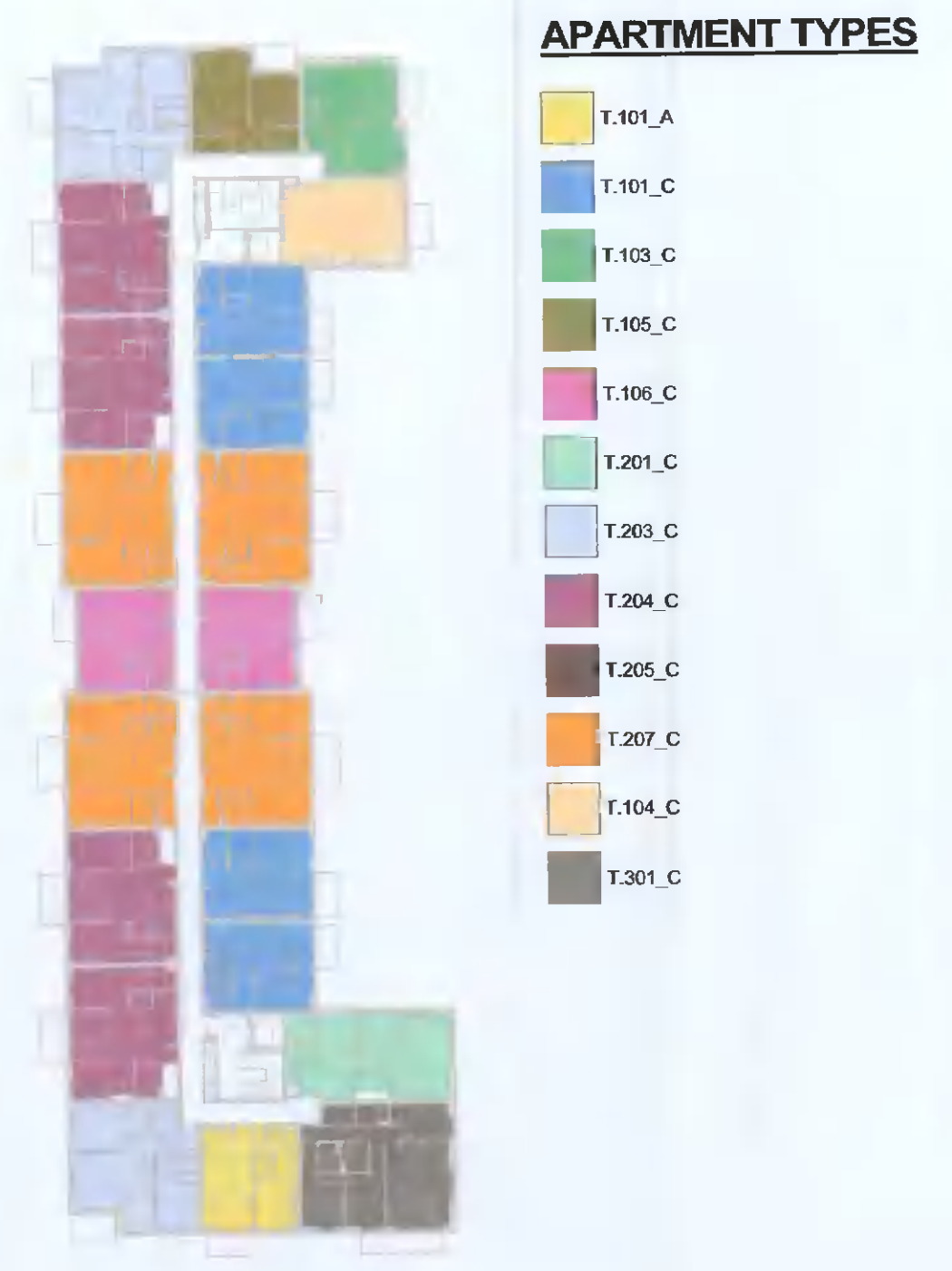
3 APT TYPES BLOCK C - LEVEL 02 1 : 500