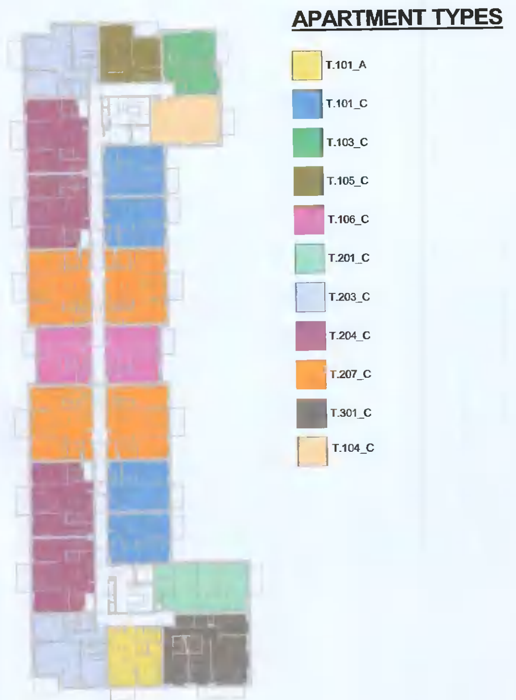
2 APT TYPES BLOCK C - LEVEL 01 1 : 500