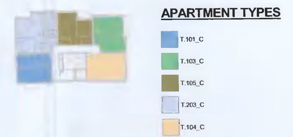
7 APT TYPES BLOCK C - LEVEL 06 1 : 500