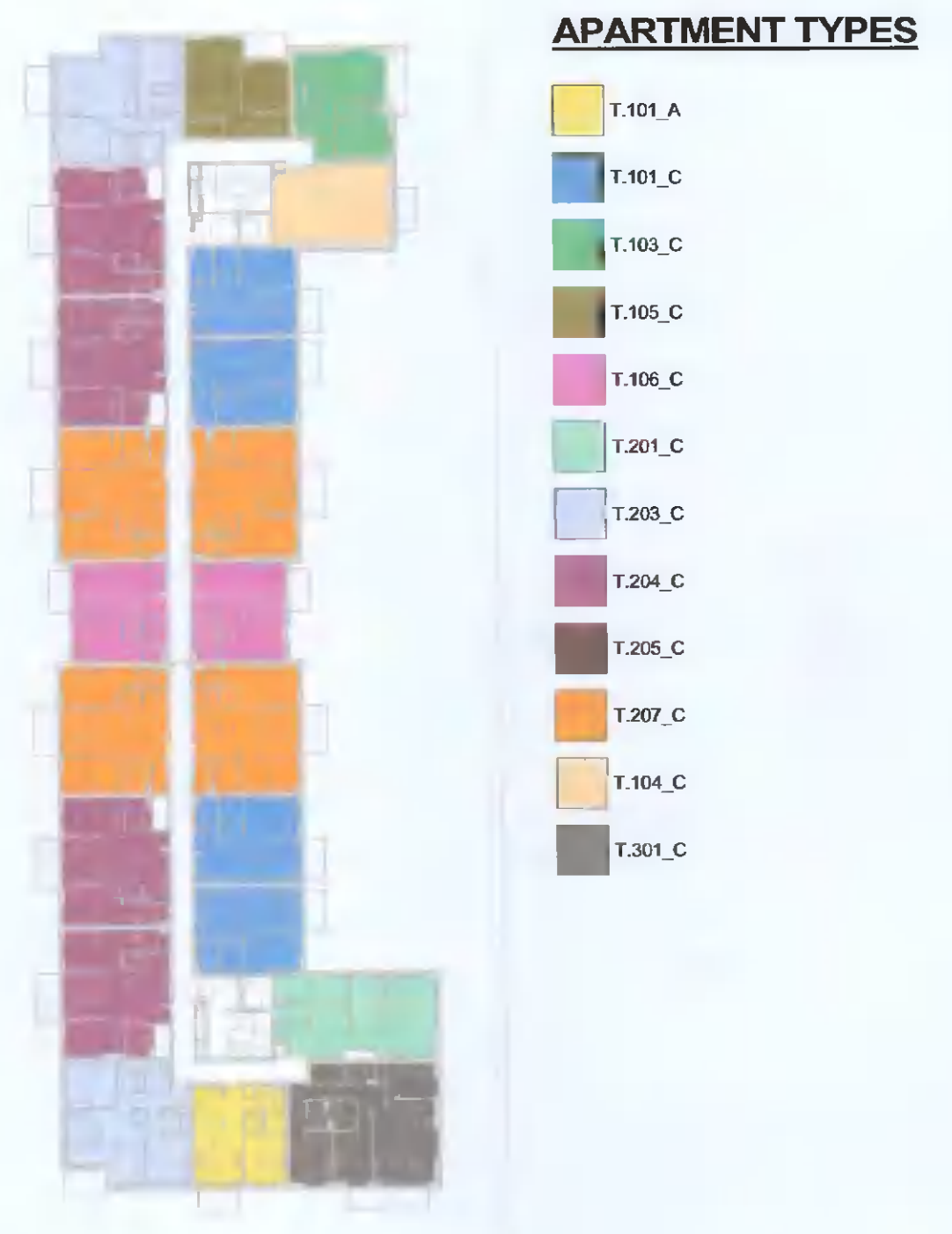
4 APT TYPES BLOCK C - LEVEL 03 1 : 500