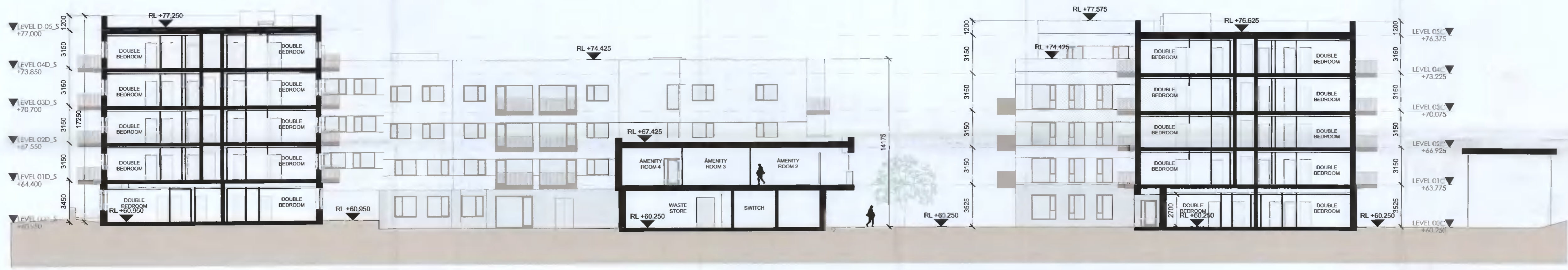
C2 Section CD2 - East West 1: 200