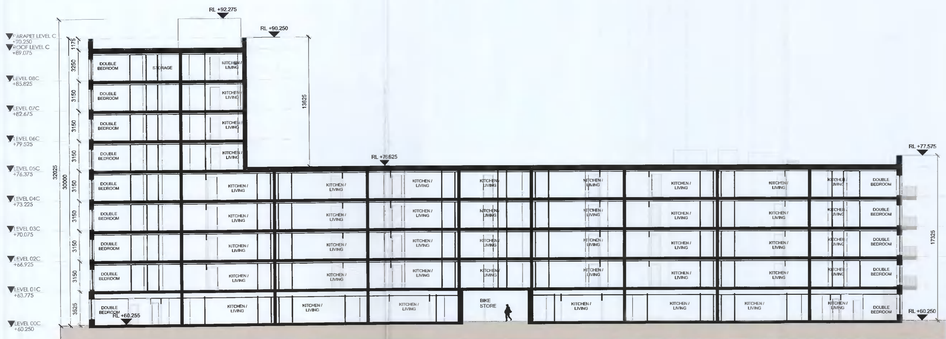
C3 Block C_GA Section North/South 1: 200