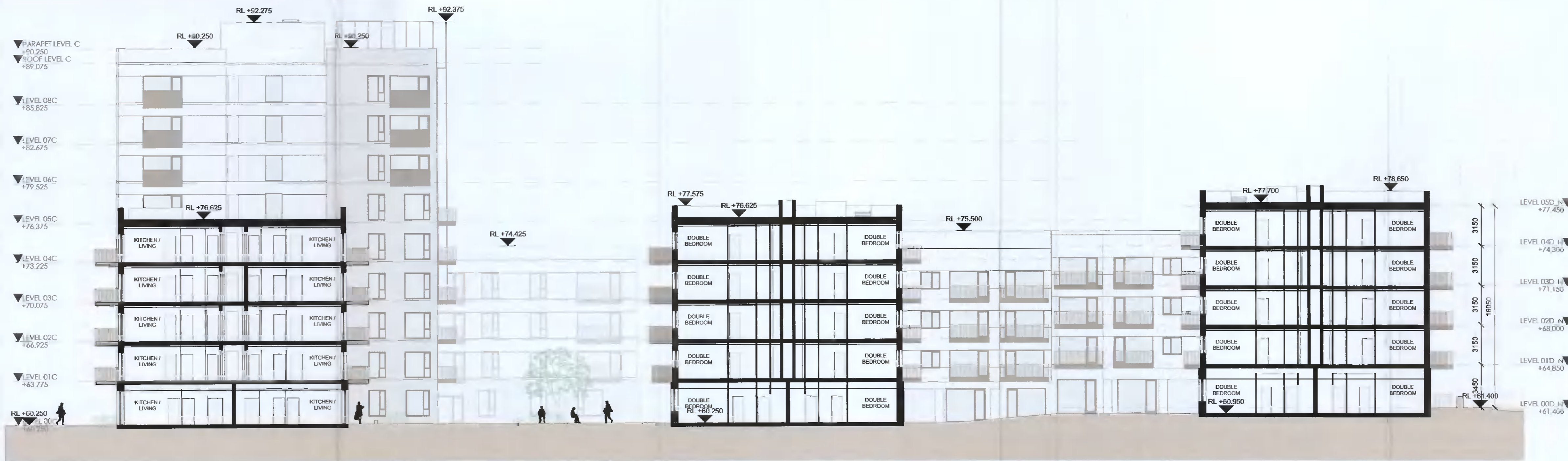
C1 Section CD1 - East West 1: 200