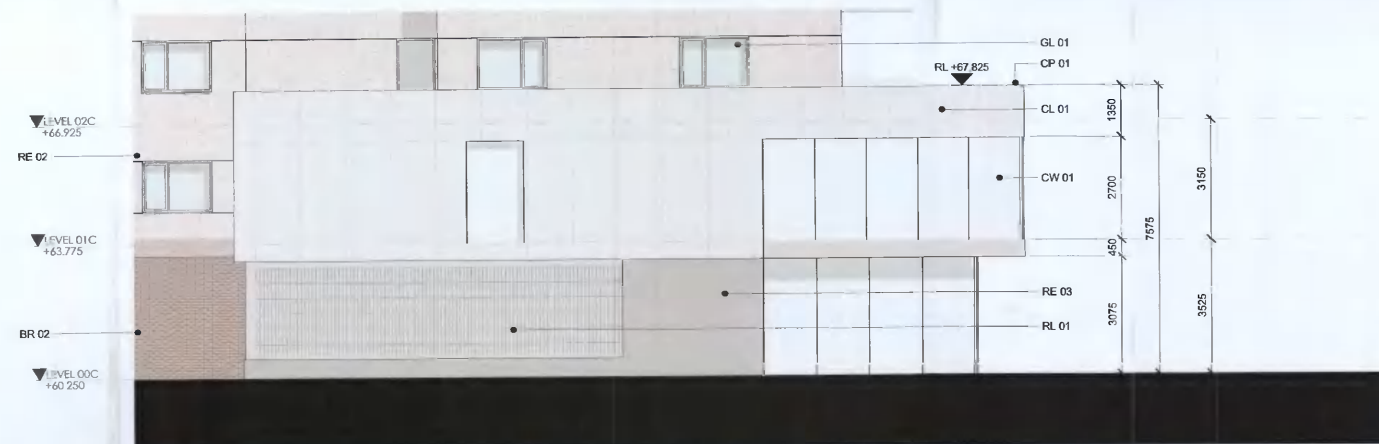
3 Block P North Elevation 1 : 100