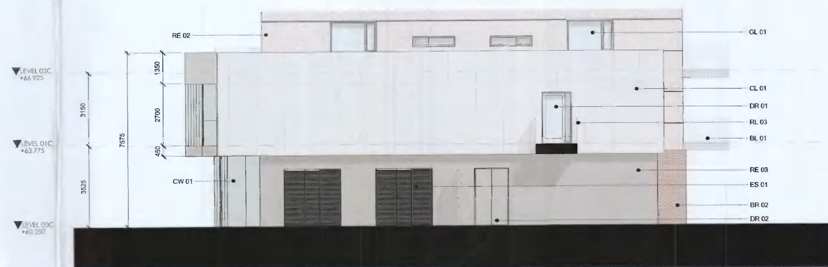
4 Block P South Elevation 1 : 100