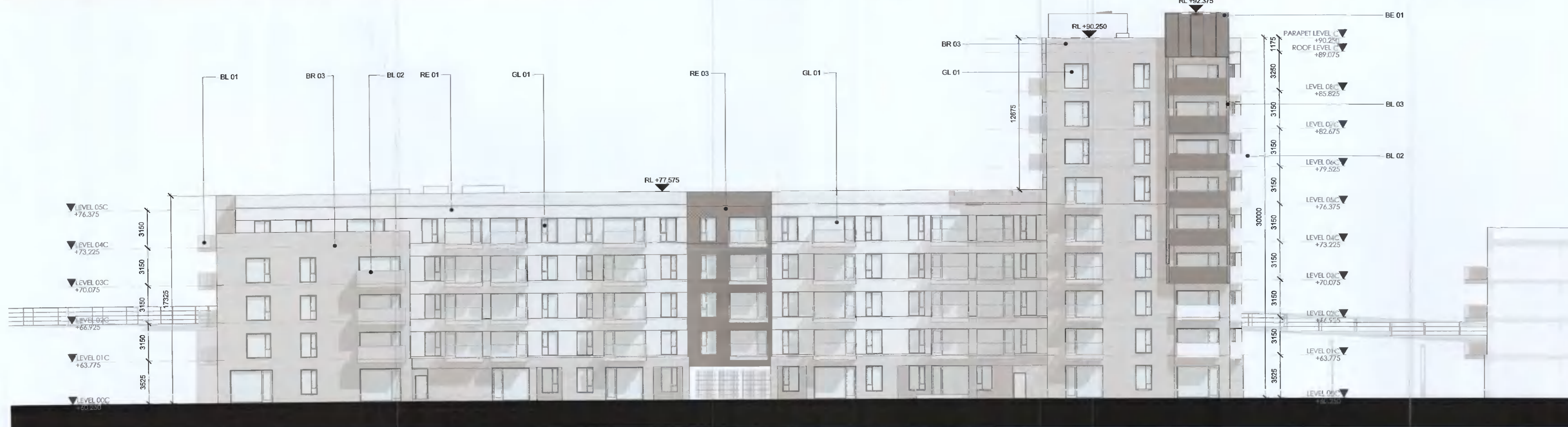
1 Block C - East Elevation 1 : 200