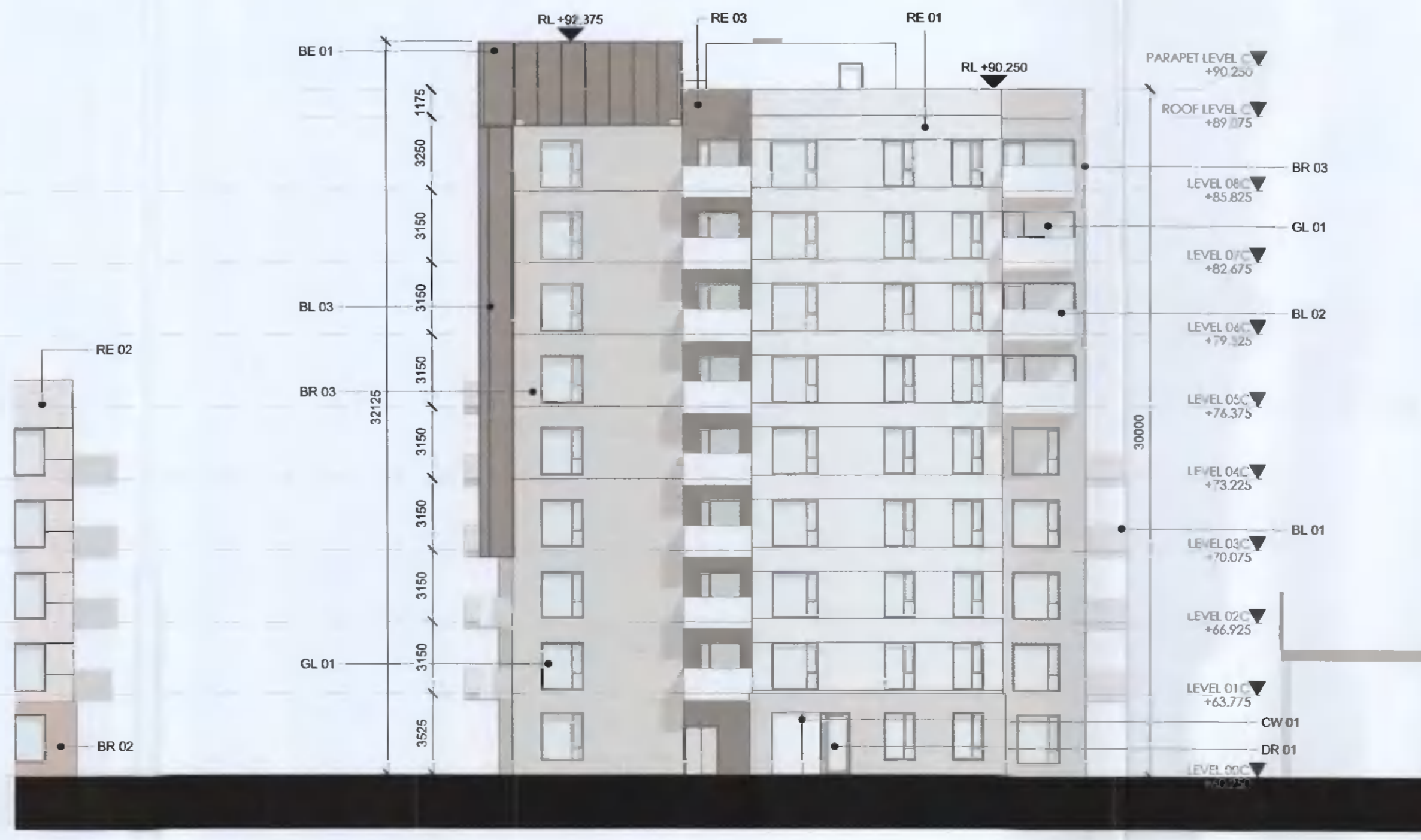
4 Block C - North Elevation 1 : 200

ALL DIMENSIONS TO BE CHECKED ON SITE NO DIMENSIONS TO BE SCALED FROM THIS DRAWING DRAWING IS TO BE READ IN CONJUNCTION WITH RELEVANT CONSULTANTS DRAWINGS