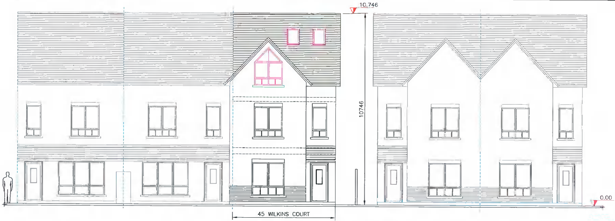
PROPOSED FRONT ELEVATION - CONTIGUOUS