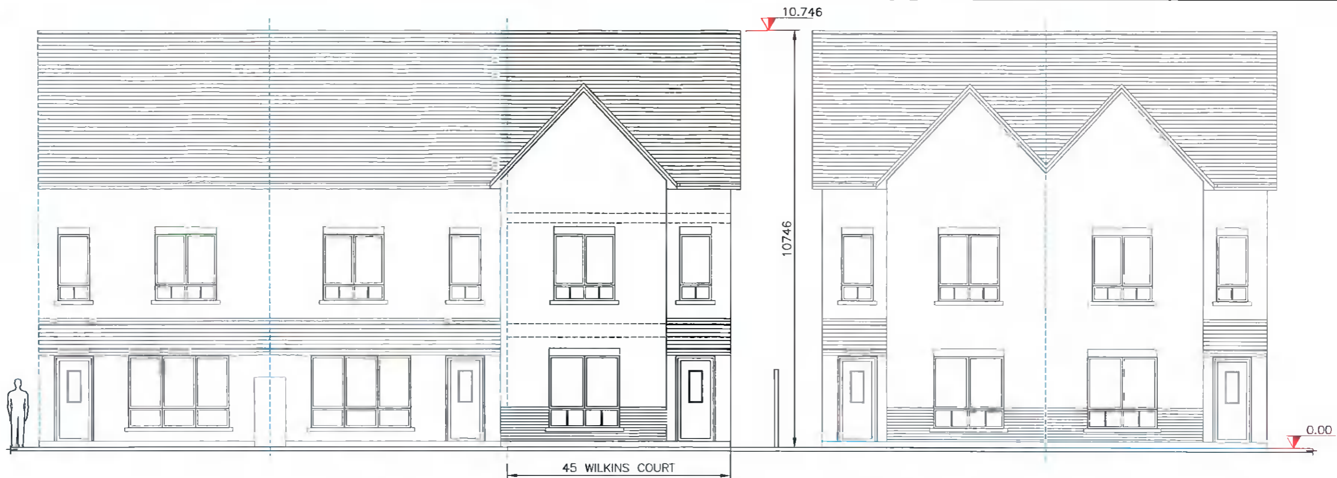
EXISTING FRONT ELEVATION - CONTIGUOUS