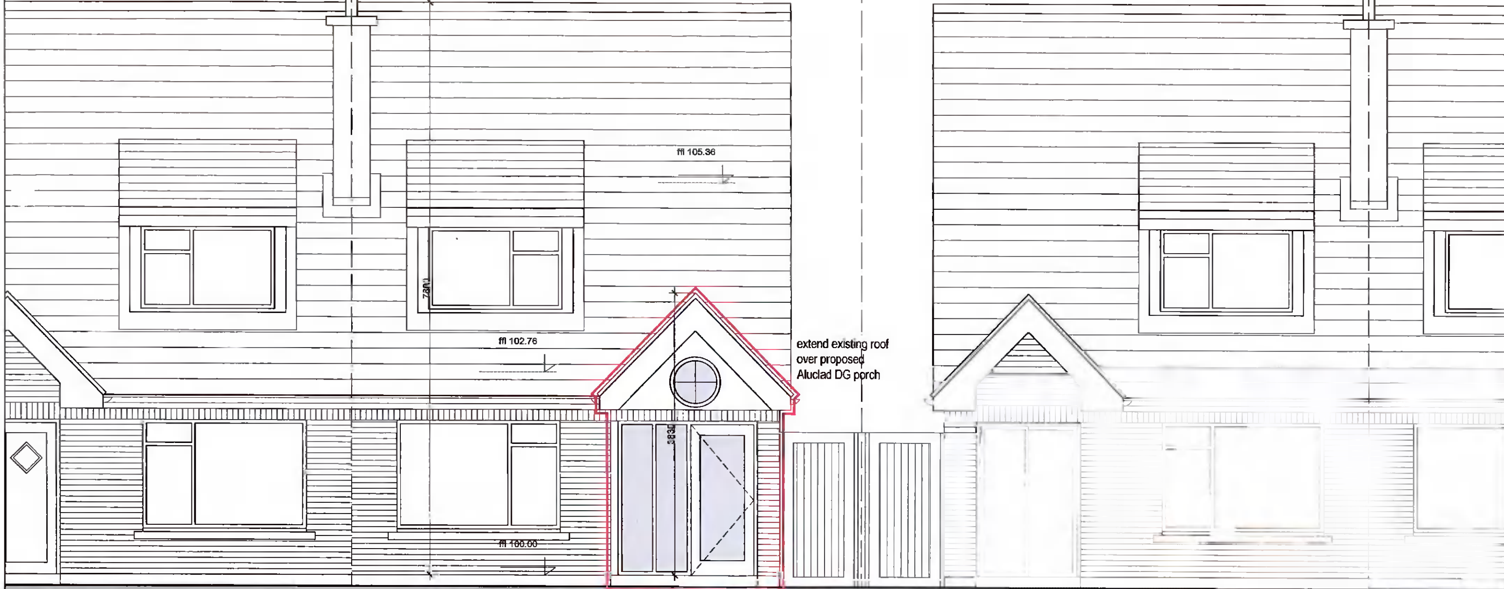
proposed front elevation 1:50 proposed works outlined in red