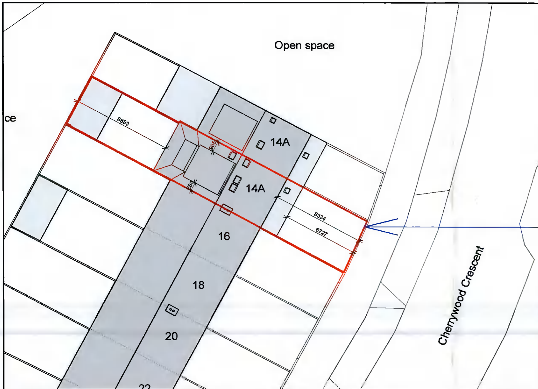
Site block plan 1:200