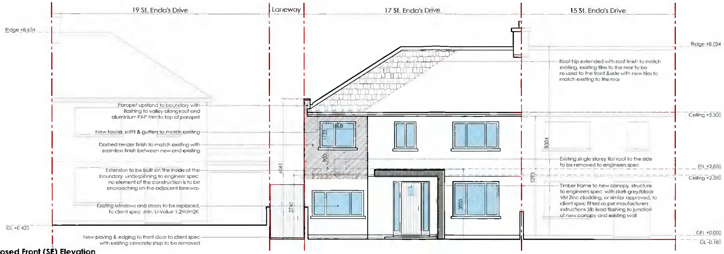
Proposed Front (SE) Elevation scale 1:100 @ A3