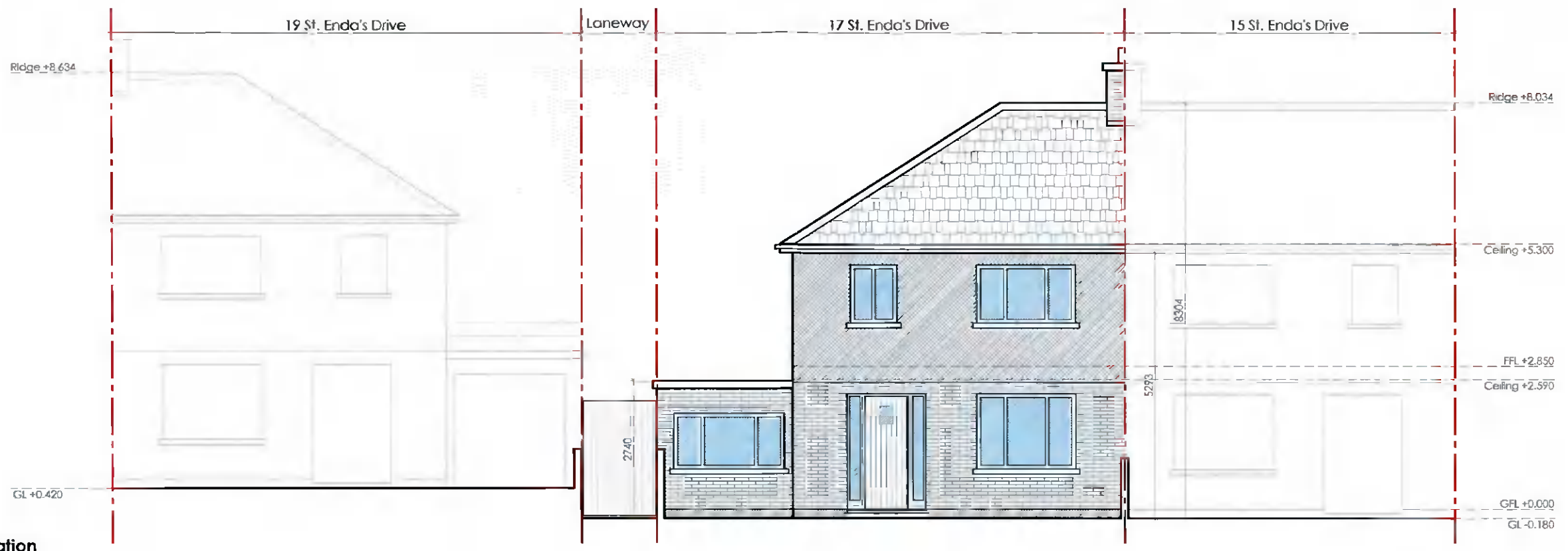
Existing Front (SE) Elevation scale 1:100 @ A3