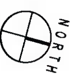
Existing Ground Floor Plan Scale 1:100 A3