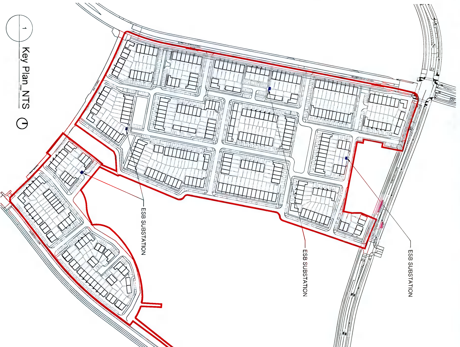
1 Key Plan_NTS