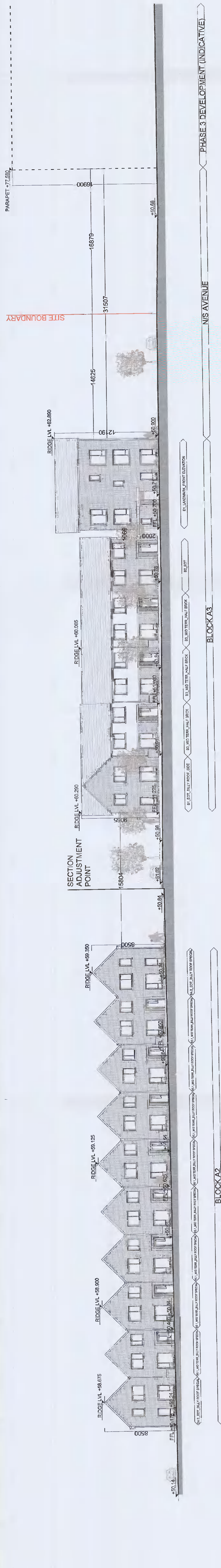
1 PROPOSED SECTION F-F 1:200