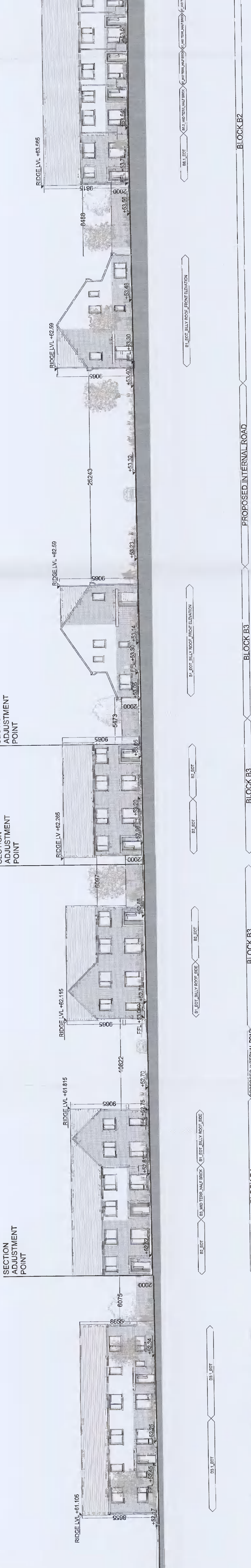
4 PROPOSED SECTION I-I 1:200