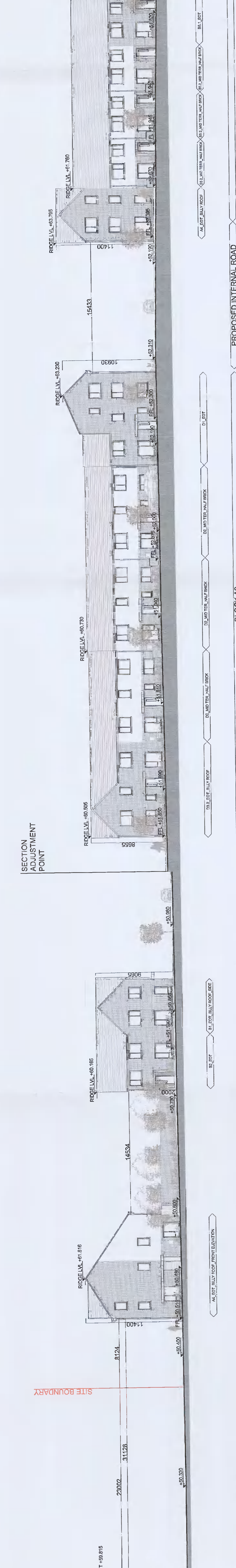
2 PROPOSED SECTION G-G 1:200